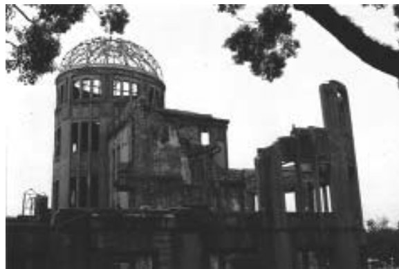
The Atomic Dome, an atomic bomb exploded 600 meters above; Hiroshima 06/08/2005

I'd like to end this letter on a note of hope. I learned that the children of Hiroshima and Nagasaki had come up with a plan to rid the world of nuclear weapons. Their idea is to ask the major nuclear weapons states to dismantle just two nuclear weapons (out of the thousands which they possess) and that they, the children, would pay for the cost of disman-