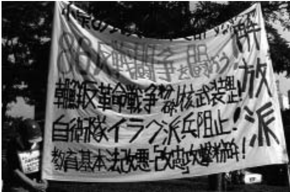
"No more Hiroshima's, no more Nagasaki's, no more wars". Hiroshima 6/06/2005 60th Anniversary of bombing

I arrived at this 'fisherman's hall' at midnight. After a