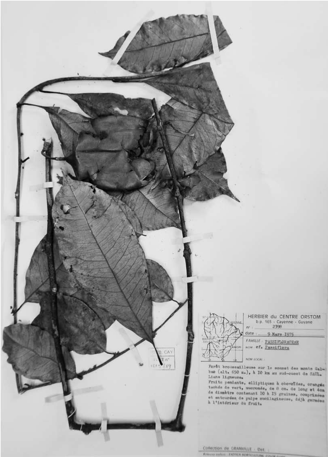
FIG. 2. Dilkea granvillei , holotype de Granville 2398 (CAY)