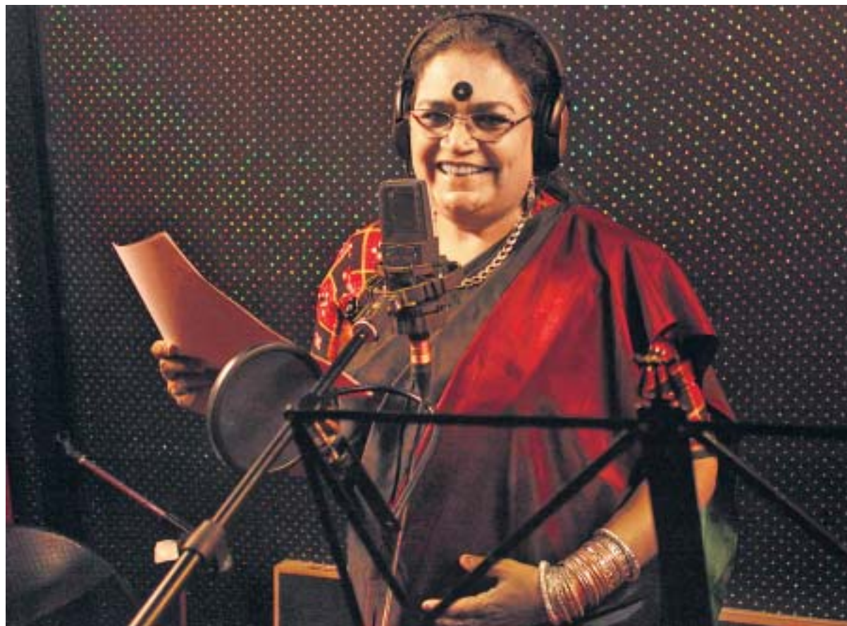
LENDING A VOICE: Singer Usha Uthup was in the city to record a song for forthcoming album Sweet 16 and Beyond. The proceeds of this song will go for the betterment of lives of cancer patients