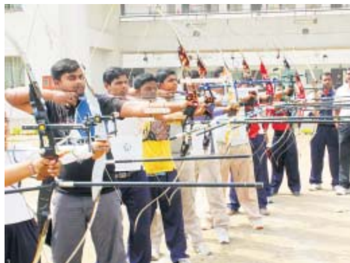
Students participating in an archery competition at Greenfingers

Gambhir added, "Sports help in physical and mental growth of the