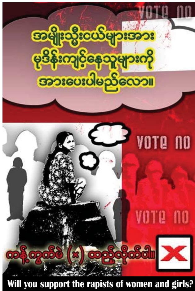
One of many anti-referendum campaign materials secretly distributed inside Burma

The authorities also distributed T-shirts free to some of the civil servants. They had large ticks on them and the words "Give your supporting vote!" The T-shirts were printed in Burmese, Shan and Pa-O.