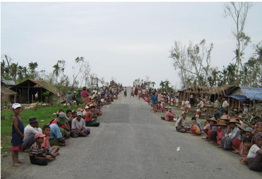
Nargis survivors waiting for aid

Instead of allowing aid to all needy peoples in Shan State, the regime has been exercising a divide-and-rule policy by opening a small door for aid agencies to give help mainly to certain "Special Regions" (under the control of strategically important ceasefire groups).