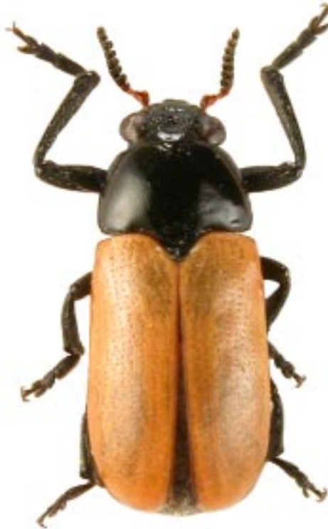
6. Afrophthalma medvedevi : habitus

MEDVEDEV (1993a) published the name Afrophthalma basilevskyi in an identification key to several Afrophthalma species. Several months later (MEDVEDEV 1993b), he presented a full and improved description of the same species with the name Afrophthalma basilewskyi . Thus, A. basilewskyi is proposed here as an objective synonym of A. basilevskyi . Body length of the holotype is 4.80 mm. This measure was erroneously given as 7.00 mm in MEDVEDEV (1993a) and corrected in MEDVEDEV (1993b).