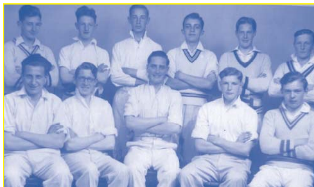
Sports Team in the 1940s