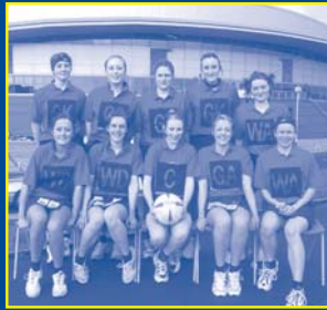
BRGS Under 16 Netball Team