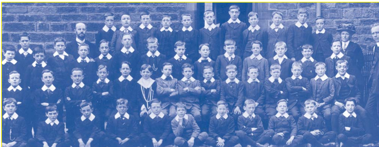
Newchurch Grammar School pupils in 1911 before the move to 'Bacup and Rawtenstall Secondary and Technical School' in 1913.

THANK YOU TO ALL OF YOU WHO WROTE AND IDENTIFIED FELLOW FORMER STUDENTS WHO FEATURED IN THE LAST 'FRIENDS OF BRGS' NEWSLETTER. HERE ARE A FEW MORE PHOTOS WHERE WE ARE TRYING TO PUT NAMES TO FACES. IF YOU RECOGNISE ANYONE ON THESE PHOTOS THEN PLEASE DO LET US KNOW.