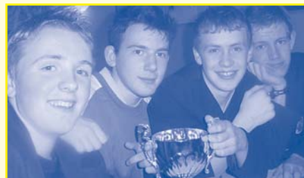
Lancashire Under 16 Basketball Champions celebrating their win!