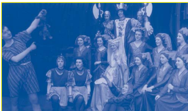
Which BRGS performers starred in this play?