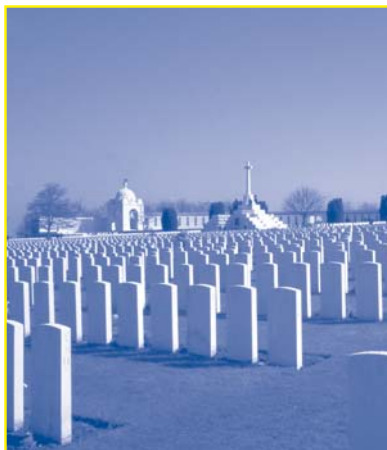
Students visited the Tyne Cot Cemetery