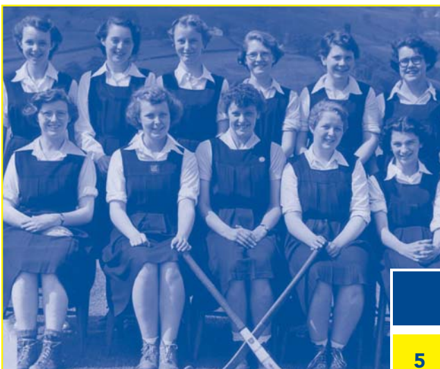
Hockey Under 14 Team in 1954-55?