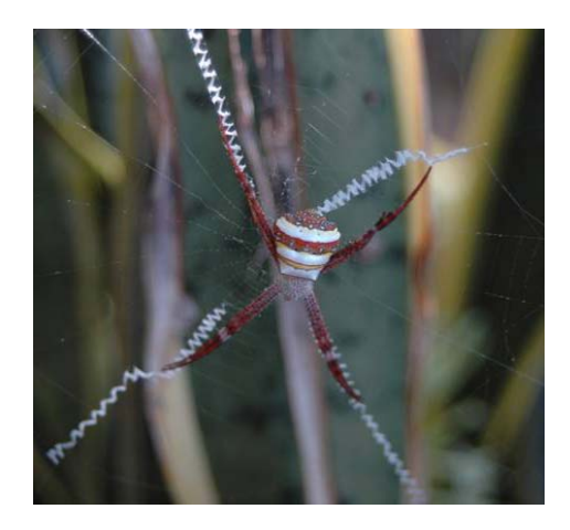
FIGURE 1. A golden garden spider, Argiope sp. is a predator of T. collina

Maha Sarakham, Sukhothai, Sakon Nakhon provinces, and three colonies from Tak province and Mae Hong Son province. Predators observed included four species of bird: the bee-eater ( Merops leschenalti ), the asian palm-swift ( Cypsiurus balasi ensis ), the black drongo ( Dicrurus macro cercus ) and the greater racket-tailed drongo ( D. paradiseus ); two species of ant: the weaver ant ( Oecophylla smaragdina ) and the fire ant ( Solenopsis geminata ); and two species of spider: the golden orb web spider ( Nephila maculata ) and the golden garden spider ( Argiope sp.) (Fig. 1).