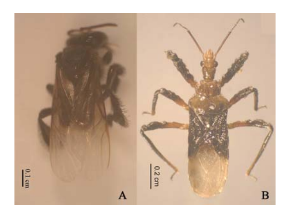
FIGURE 2. Dorsal view of adult specimens, Trigona collina (A) and Pahabengkakia piliceps (B).

assassin bug. Pahabengkakia An piliceps Miller, 1941) (Fig. 2B) (Hemiptera: Reduviidae: Harpactorinae), was found in six of the ten colonies that were dissected exhaustively (Appendix 1). Nymps of the bug occupied the nest entrance and killed returning forager bees. Male and female adult and nymphal P. piliceps show a curious behavior that involves the capture, immobilization and feeding on the prey. Bugs use their legs to capture and immobilize returning foragers. They use their rostrum (beak) to pierce the