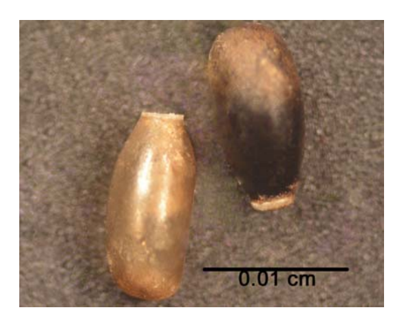
FIGURE 3. Eggs of Pahabengkakia piliceps found with in the entrance tube of Trigona collina nests.

widened in the middle, exposing the lateral margins of the segments beyond the wings (Fig. 2B).