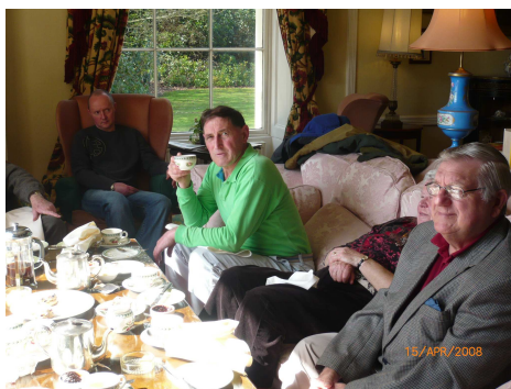
The Kendal Group Enjoying cream tea!

On the left - Farnborough Group having received their Voluntary Award.