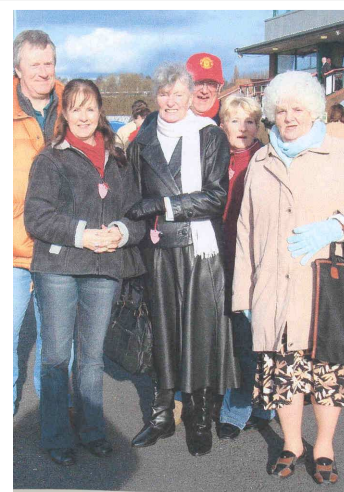
Above - Staffordshire Group enjoying a day at Wolverhampton races.

Photographed here celebrating Christmas Lunch in January! Very Sensible!