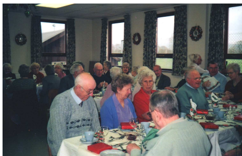
Above - The Preston Group and to the left the Basingstoke Group

Photographed here celebrating Christmas Lunch in January! Very Sensible!