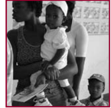
A mom and child receive vitamins donated by MPS.