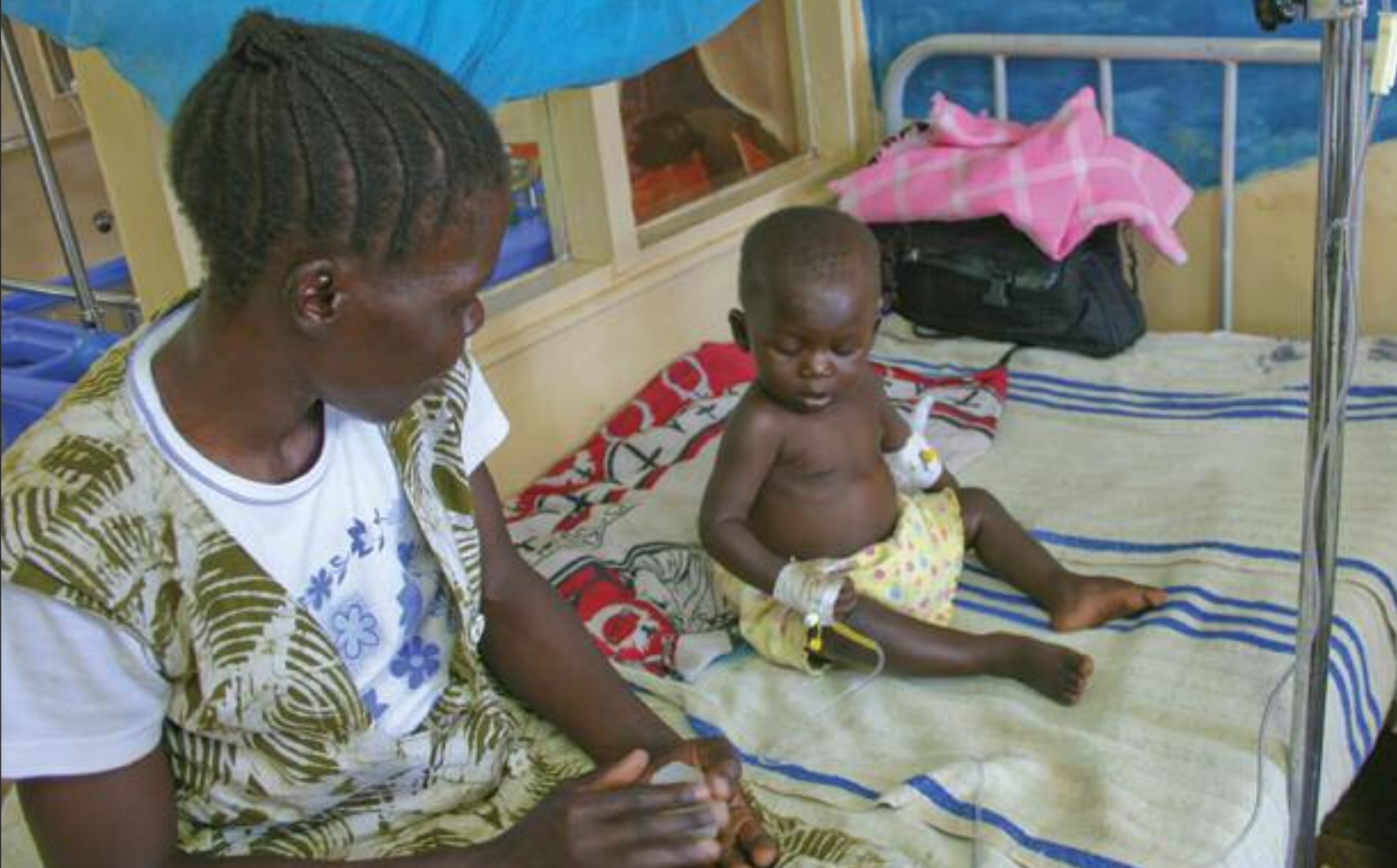
For the G-20 Agenda? A mother tends to her child, who is being treated for malaria at Siaya District Hospital in Kisumu, Kenya. A Phase III trial of an advanced malaria vaccine was carried out by the Kenya Medical Research Institute and US Centers for Disease Controls and Prevention. The Global Alliance for Vaccines and Immunization is looking to the day when malaria will be a vaccine-preventable disease.

committed to transforming themselves into “democratic, developmental states,” the G-20 should prioritize the continent’s educational needs at all levels.