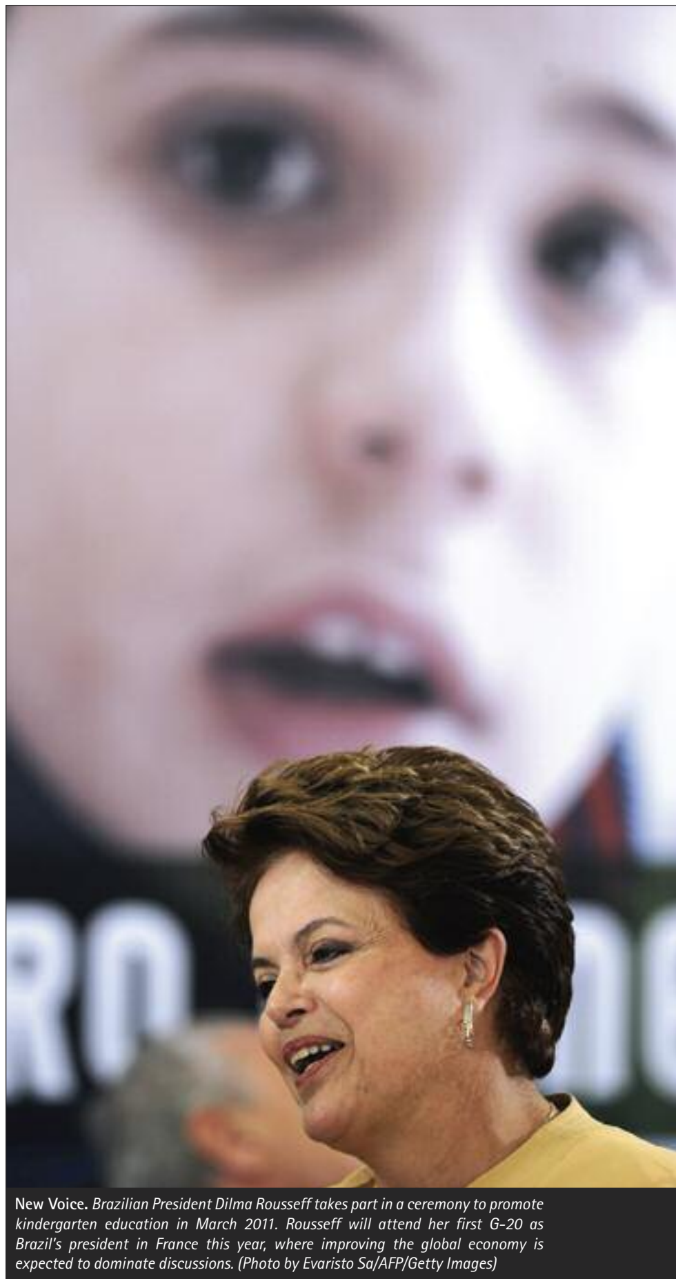
New Voice. Brazilian President Dilma Rousseff takes part in a ceremony to promote kindergarten education in March 2011. Rousseff will attend her first G-20 as Brazil's president in France this year, where improving the global economy is expected to dominate discussions.