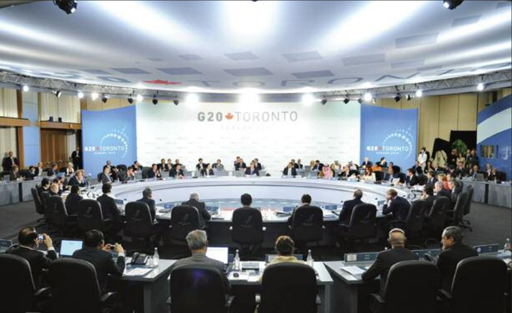
Club Politics. World leaders gather for the opening session of the G-20 summit in June 2010 in Toronto, Ontario. The G-20 is now recognized as the world's premier forum for economic issues, though some argue its inclusion of emerging powers like China, India, and Brazil make other topics ripe for discussion.