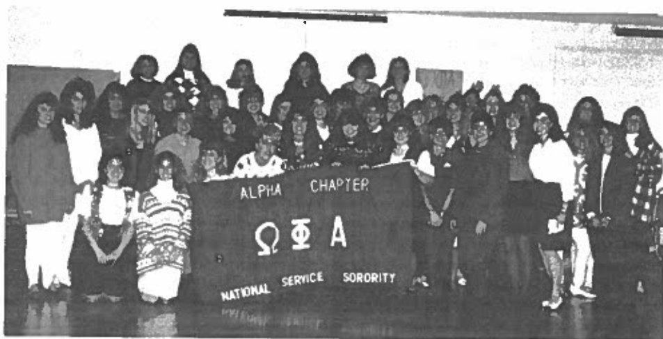
Alpha Chapter at a recent formal meeting

Look out Alpha. . . Omicron is ready for Convention 1993.