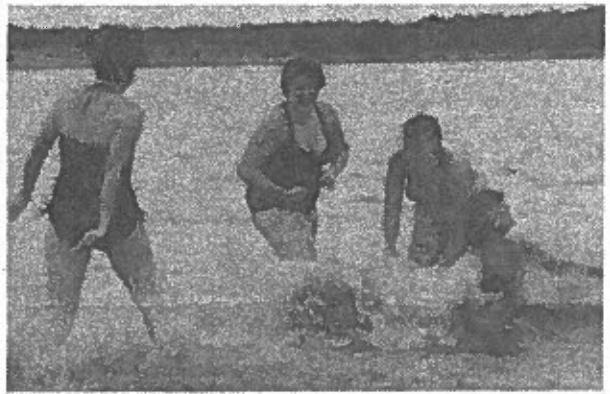
"...And we LOVE you!"