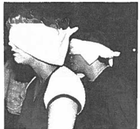
First year "initiations" for the new delegates.