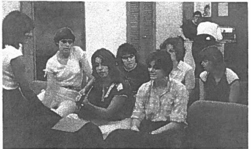
Joining together in song... a favorite "thing to do" at conventions.