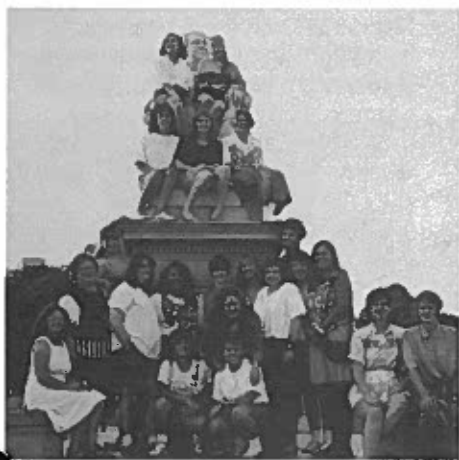
P.T. Barnum amid Convention '91 attendees

"Their advice to us was to answer those same questions and not be afraid to change the plan as we traveled through our life. Two months later, as I began to prepare myself to lead OPA, I found myself thinking of that couple. I realized that in order to move forward we needed to ask ourselves the same questions. . . I wish I had a crystal ball to answer the final question. But I don't. I only have this kaleidoscope. When I look inside, I see how easy it is to change things.