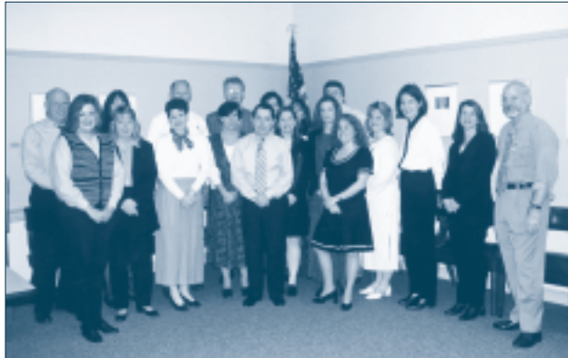
Office of the State Courts Administrator's Legislative Team

The 2001 Legislative Session should be an educational one, with 12 freshman Senators and 63 freshman Representatives. The goal of the Office of the State Courts Administrator's Legislative Team is to have a well-coordinated approach for all issues, both substantive and budgetary. The legislative team will be tracking legislation and distributing weekly reports each Friday. Judges and other personnel with expertise on a broad range of topics will be helping us on proposed legislative bills. If you have questions or concerns regarding legislation, please call the legislative office at 850-922-5692.