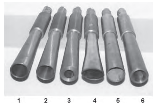
Figure 6. Test barrels.

George, in English Guns & Rifles , states that blunderbusses were strongly reinforced at the breech to allow for the use of a heavy powder charge. A 4-gauge charge was not less than 12 drams of powder and a quarter of a pound of swan-drops. 11 Swan-drops are described as being 15 pellets per ounce, 240 per pound (.27 caliber, No. 2 buckshot). The gunpowder to projectile weight for this charge is 19 percent.