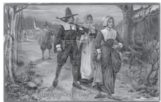
Figure 2. Thanksgiving, Pilgrims, Church, Bible, and Blunderbuss (1909)