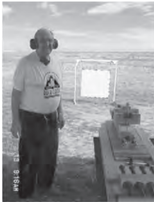
Target is suspended by straps at the top and secured by bungee cords at the bottom.

All of the tests have been made at 10 yards. The normal blunderbuss range is said to be ten to twenty paces (25 to 50 feet). Testing at this short range is thought to be the appropriate distance because of the large size of the blunderbuss shot patterns. Often a large number of the holes made by buckshot pellets striking the target cannot be detected, either because the shot pattern struck the target off-center, two buckshot pellets made only one hole, or because the