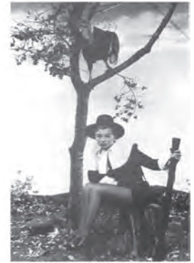
Figure 5. Marilyn Monroe commemorating Thanksgiving 1950

The blunderbuss was developed during the 16 th century, probably in Germany. 3 One historian, J. Alm, believed the origin to be Holland, however he does not mention any facts to defend this theory. 4 Leonhardt Fronsberger's book on military matters, Von Kayserlichem Kriegsrechten , published in Frankfurt, Germany in 1556 describes a short-barrel smooth-bore gun shooting 12 or 15 bullets of musket bore, comparable to the charge of a blunderbuss. These weapons were used by troops during the assault when the weapons' scattering effect was considered extremely advantageous. 5