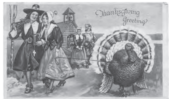
Figure 1. Thanksgiving, Pilgrims, Church, Bible, and Blunderbuss (1920)

There is important information that was overlooked in the study pertaining to the time period, the country or countries where the blunderbuss was developed, and where a large number of Pilgrims lived prior to immigrating to America.