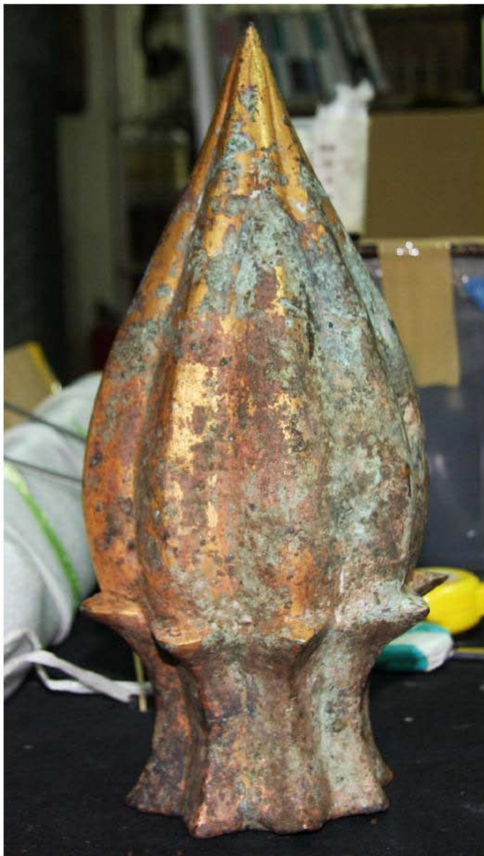
GILDED BRONZE PINNACLE