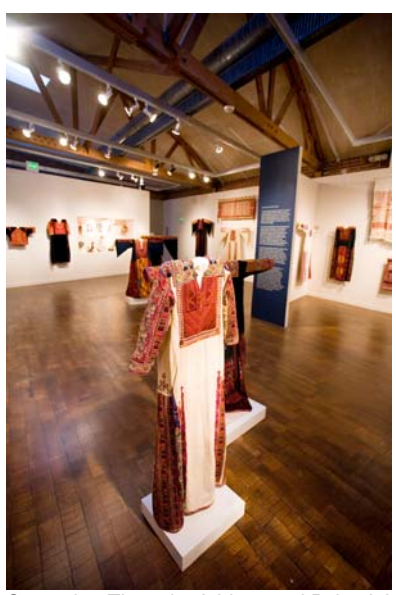
Sovereign Threads: A history of Palestinian Embroidery Exhibition view at the Craft and Folk Art Museum, Los Angeles