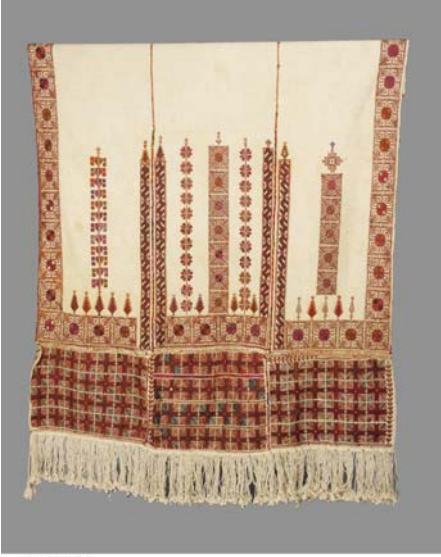
El Khalil region Headscarf, circa 1930s Linen fabric embroidered in solk crosstitch F, and H. Munayyer Collection