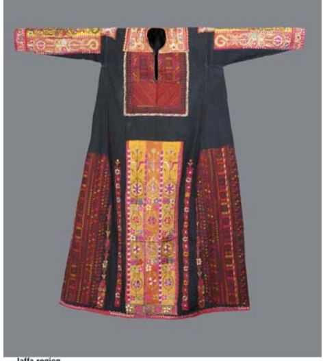
Jaffa region Black ceremonial dress from Beit Dajan, circa 1940s Linen embroidered in silk crosstitch; front silk panel embroidered in couching stitch F. and H. Munayyer Collection