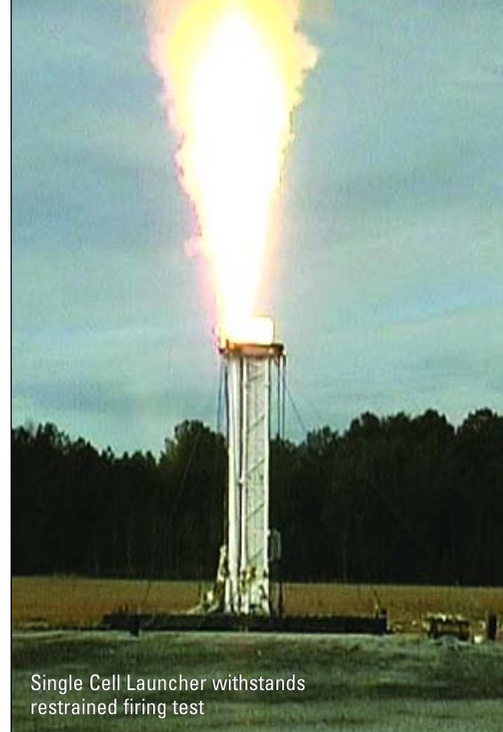
Single Cell Launcher withstands restrained firing test

Over the life of the MK 41 VLS program, the U.S. Navy has invested more than $500 million dollars. Today there are more 11,000 MK 41 VLS cells found aboard 16 different ship classes in 11 navies around the world. International customers will benefit from the shared SCL components,