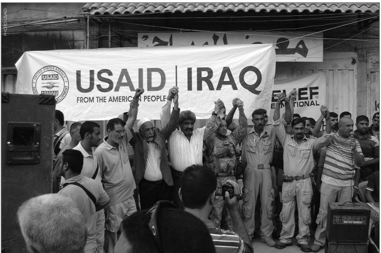
After a series of USAID-funded confidence-building roundtables, workshops, and trainings, Sunni and Shia leaders commemorate the removal of a wall separating the formerly violent Al-Fadhl and Abu Sayfayn neighborhoods of Baghdad, Iraq.

In Bosnia and Herzegovina, USAID's Office of Transition Initiatives helped local partners shape media messages to counteract hardline nationalist attitudes that persisted after the Dayton Peace Accords. Information campaigns promoted respect for human rights and basic freedoms, and delivered objective information in volatile areas to help minimize violence against minorities. Follow-up activities funded by the Mission promoted reconciliation, community collaboration, and independent media.