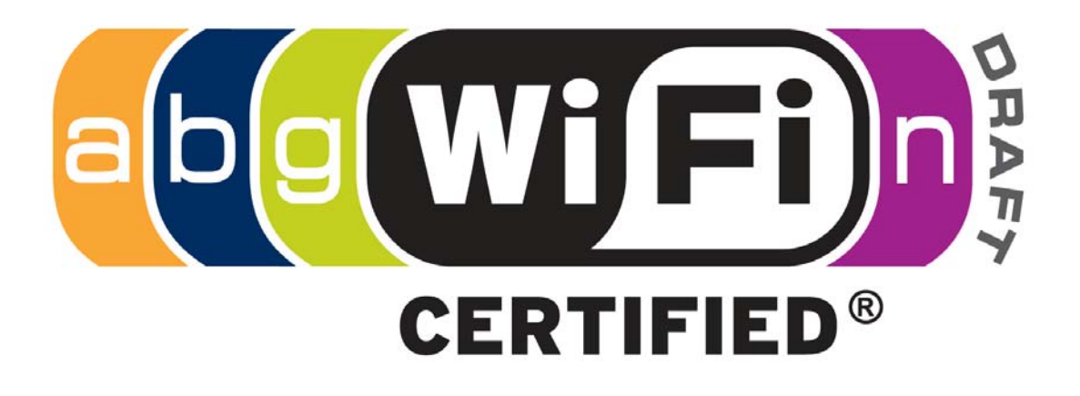
Fig 3: Wi-Fi CERTIFIED Logo with SIIs for 802.11 a, b, g and draft n physical layers

The Wi-Fi Alliance Wi-Fi CERTIFIED logo has been updated to accommodate draft 2.0based certified products and indicate backward compatibility with 802.11 a/b/g gear. The a, b, g and n elements of the logo indicate physical layer compatibility when present.