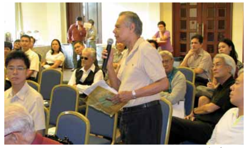
continued next page

Many Eurasians "don't know each other" and at the moment did not network enough, she added.