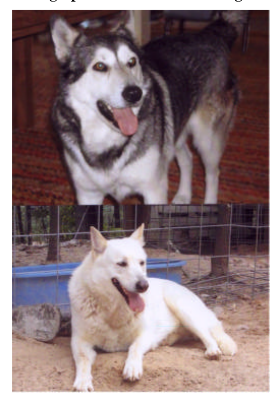
Photograph 1: Low content wolfdogs