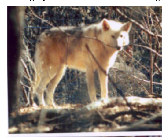
Photograph 2: Medium content wolfdogs