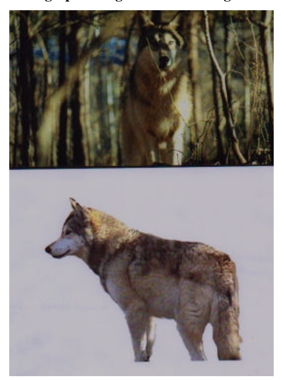
Photograph 3: High content wolfdogs