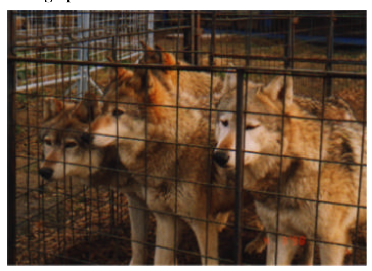
Photograph 4: Pure wolves