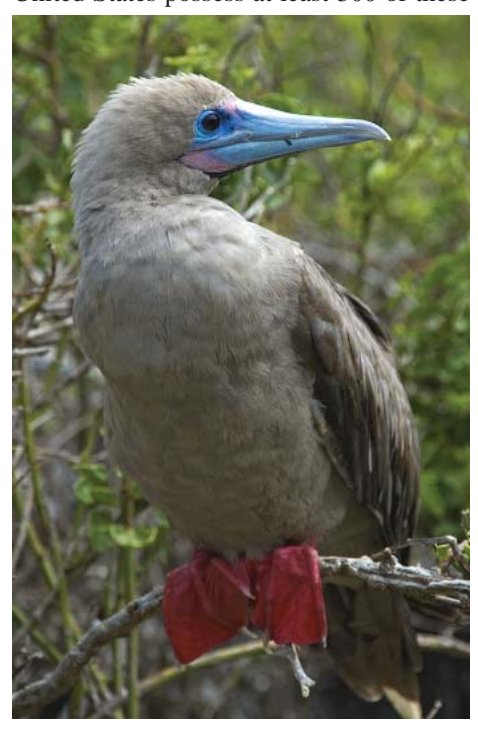
EarthJustice sued to stop military exercises that it claimed threatened the red-footed booby, a bird indigenous to the Northern Mariana Islands.

"Modern diesel-electric submarines pose a significant threat to Navy vessels because they can operate almost silently, making them extremely difficult to detect and track," Roberts wrote. "Potential adversaries of the United States possess at least 300 of these