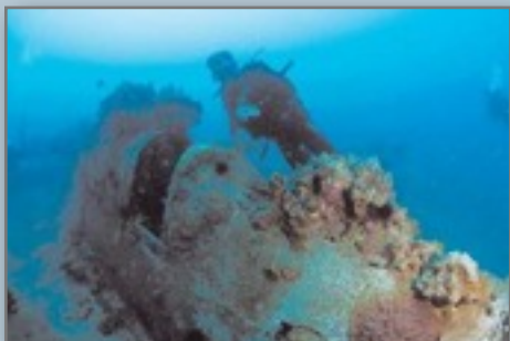
A scuba diver made the dive of his life when he found what appears to be the previously undocumented wreck of a World War II-era dive bomber off South Maui.

This B-18 "Bolo" Bomber, serial number 36-446, crashed February 25, 1941 with six crew members aboard. They were flying as part of a 4 aircraft group on a routine instrument night training flight assigned to the 50th Reconnaissance Squadron, 18th Bombardment Wing from Hickam Field. The aircraft were at different altitudes and vectors to avoid a mid-air collision, but maintained radio contact. Aircraft serial number 36-446 was flying at approximately 10,000 feet in the vicinity of Hilo when a bearing failure caused the loss of the port engine. The pilot, Captain Boyd Hubbard (later Brigadier General; 1912-1982) then attempted to reach Suiter Field on the northwest tip of the island. All possible fuel and cargo was jettisoned, but the aircraft was too heavy to maintain altitude on one engine. As the aircraft descended, the other engine began sputtering. The crew believed they were over the ocean at the time in heavy fog during the dark night. The pilot made a last split-second correction prior to the crash. Read ON ( maps | vintage photos | aircraft details )