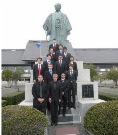
International Students Enrolled in 2011