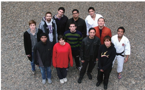
Former International Students