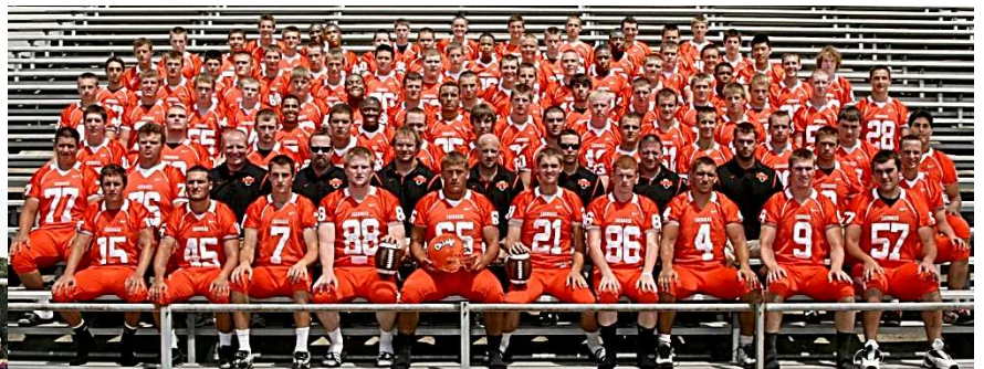
Cherokee High School – Group Four