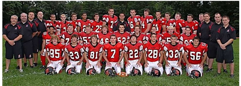
Haddonfield Memorial High School – Group Two