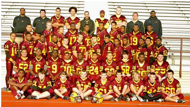
Glassboro High School – Group One