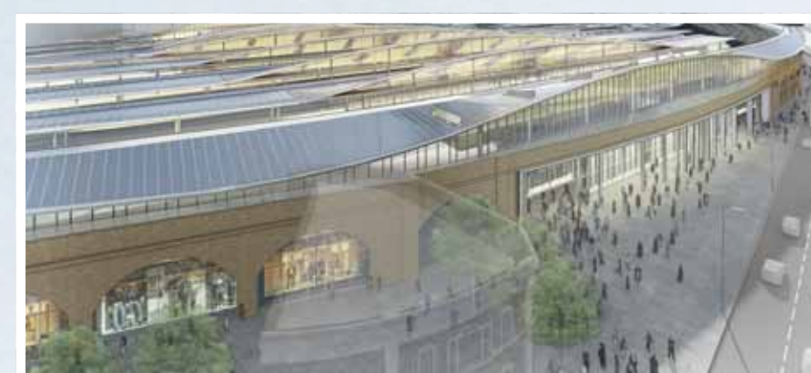
Aerial view of London Bridge station (Shipwrights Arms faded for image purposes only)