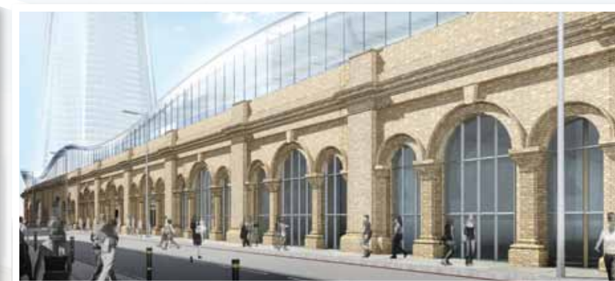
View of St Thomas Street from the East