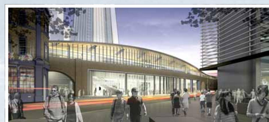
View of the new Tooley Street entrance

With entrances on Tooley Street and St Thomas Street, connections to and between the surrounding areas will be improved, helping to regenerate the area. Tube and bus links will be improved and lifts and escalators will provide step-free access to every platform.