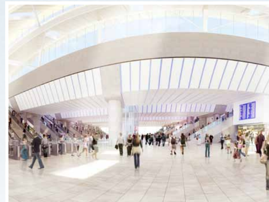
View of new station concourse