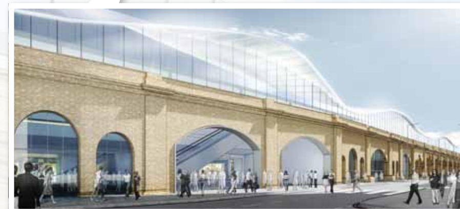
View of the new St Thomas Street entrance from the West