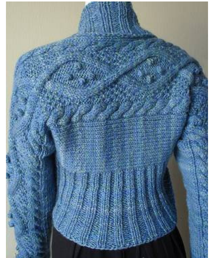
The striated colors of Kaya form random color in the knit garments.

Cross to Right: To work, place 1 st on cable needle, hold to back of work, K the next 3 sts from left needle, then K the st from cable needle.