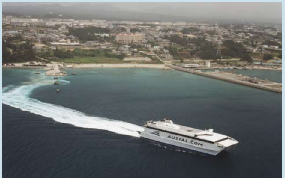
The all aluminium 101m "WestPac Express" remains in service with the US Marine Corps in Okinawa, Japan after more than eight years.

All of the advantages of an aluminium vessel have been realised on "WestPac Express".