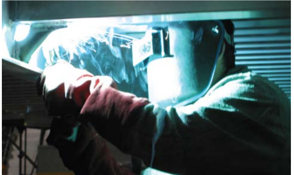
All Austal's weld processes and welders are certified in accordance with Classification Society requirements to guarantee the welded strength of all structural elements.

Certain areas of all vessels, such as those in way of the propulsion machinery, are subject to significant cyclic loads over the vessel's life. The detailed structural analysis of these areas is essential to ensure that the design stress values do not exceed an acceptable fatigue stress range. This type of analysis allows the cumulative effect of low cycle steering and reversing loads to be considered, as well as the high cycle blade pass frequencies. As a result of this type of analysis, Austal has an unparalleled track record in the design and manufacture of reliable aluminium structures.