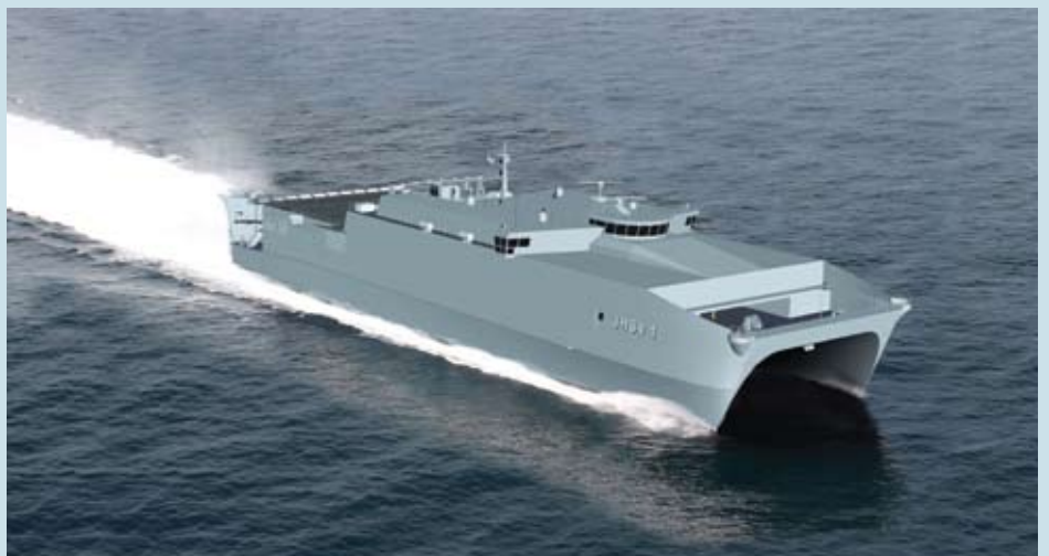
The first of ten Joint High Speed Vessels commences construction for the US Navy in 2009, reinforcing the advantages of aluminium for the largest navy in the world