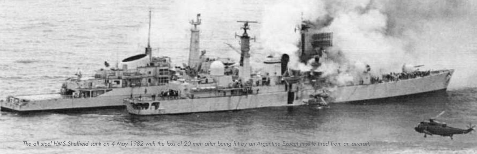
The all steel HMS Sheffield sank on 4 May 1982 with the loss of 20 men after being hit by an Argentine Exocet missile fired from an aircraft.