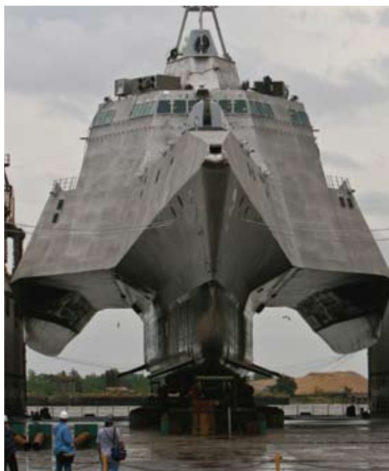
▲ Littoral Combat Ship "Independence" is an all aluminium combatant with no exterior hull coating above the waterline, dramatically reducing maintenance costs

An aluminium hull structure reduces displacement and provides margin for additional capability including weapons and sensors.