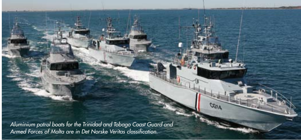
Aluminium patrol boats for the Trinidad and Tobago Coast Guard and Armed Forces of Malta are in Det Norske Veritas classification.

The use of physical model testing and sea-keeping computer simulations helps provide a comprehensive set of accelerations, pressures and global loadings to be applied to a particular vessel design, which are both accurate and acceptable to the relevant