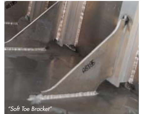
Correctly designed aluminium structures will operate effectively for up to 30 years without any structural issues or the need for a single coat of paint.

Aluminium structures which are designed correctly will operate effectively for up to 30 years without any structural issues or the need for a single coat of paint.