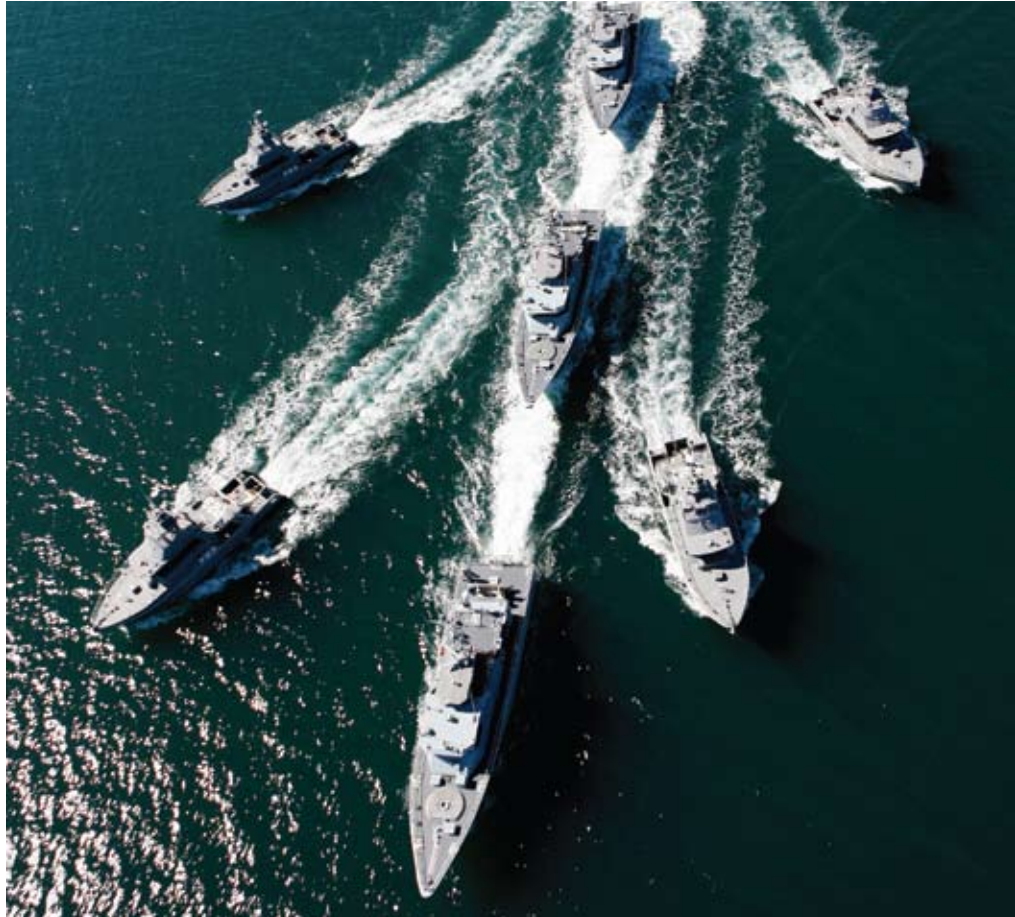
▲ Many countries are recognising the advantages of Austal's high speed, lightweight aluminium platforms.

The corrosion resistance of marine grade aluminium alloys ensures that protective coatings are not required on all hull surfaces. The protective aluminium oxide layer that forms on the material surface ensures that bilges, tanks, voids and other interior spaces do not require annual maintenance and coating. A number of naval platforms such as the LCS have been manufactured with no topside paint which further reduces the ship weight and maintenance cost.