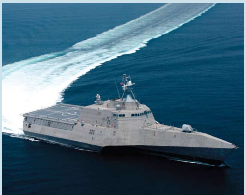
The Austal designed and built 127m aluminium Littoral Combat Ship, LCS 2 "Independence"

Steel and Aluminium materials are non-combustible and do not burn. Aluminium conducts heat more effectively than steel. This thermal conductivity assists in the dissipation of heat during a fire and allows rapid boundary cooling of exposed structures.