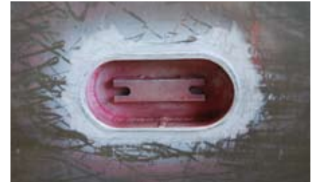
Austal uses passive Zinc anodes to protect the hull from galvanic corrosion. They are mounted in recessed anode pockets (pictured) along the hull to limit any flow discontinuity in way of anodes.