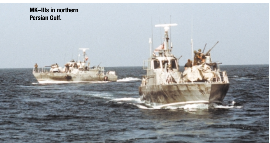
MK-IIIIs in northern Persian Gulf.