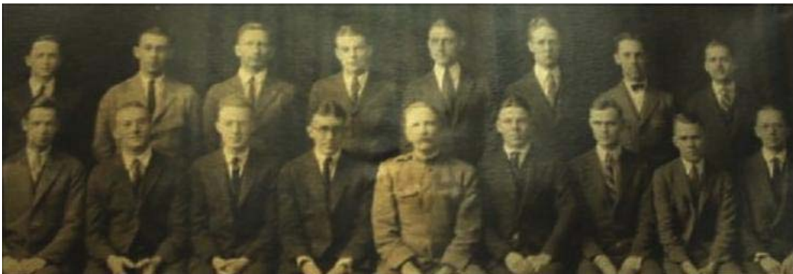
The Zeta Chapter of Kappa Kappa Psi

During the 1950's the role of expansion and revitalization became the most important aspect of the Fraternity. Many chapters flourished from Pennsylvania, Maryland and Virginia. Unfortunately, many new chapters folded within the first two years of activation due to the instability of their new band programs. Revitalization of old chapters became the District's priority in the 1970's and 1980's. A few early chapters were reinstalled to serve their bands. Some revitalization efforts failed and those chapters have remained inactive. From the 1980's to the present the Northeast District of Kappa Kappa Psi has expanded to having a chapter present in all states in its boundaries except for Vermont, and New Jersey.