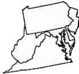
District XI 1949-1955