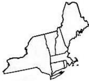
District X 1949-1955

The first District Designation of the present day to include the Northeast was the Eastern District 3 . From 1949-1955 District X and District XI occupied the boundaries of the Northeast District. The reorganization of District Lines at 1955's National Convention caused Districts X and XI be redistricted to allow balance due to the expansion of both organizations. 4 District X consisted of Connecticut, Maine, Massachusetts, New Hampshire, New Jersey, New York, Rhode Island, and Vermont. District XI consisted of Pennsylvania, Maryland, Delaware, District of Columbia, Virginia, and West Virginia. Both Districts agreed to meet together for Convention in 1958. This was also the first time that Tau Beta Sigma had appeared at any District Convention in the Northeast. By 1969 District IX took the place of Districts X and XI. In 1987 District IX was dubbed the Northeast District and continues with this designation to the present.