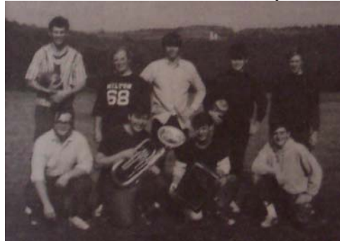
Epsilon Iota, "Home Team"