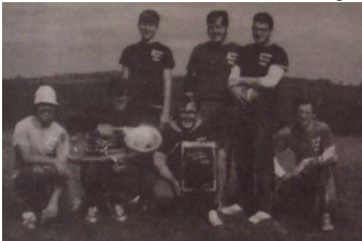
Gamma Xi, "Visiting team"

Gamma Xi finally passed the Baritone off in October of 1970, in the World's first "Baritone Bowl" held at Mansfield University. The game took place on a "very, very, very muddy field at Mansfield State College." "At stake: absolutely nothing." Mansfield was scheduled to receive the Baritone regardless of the outcome of the game. The game resulted in a 7-7 tie, and the Traveling Baritone found a new home in Pennsylvania.