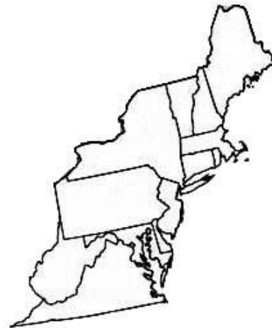
District IX 1969-1987 Northeast District 1987- Present