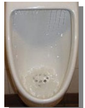
Left: Waterless urinal