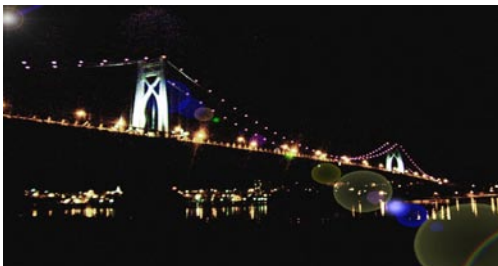
The Mid-Hudson Bridge in Poughkeepsie, NY wore a necklace of purple lights in October 2008 in recognition of Domestic Violence Awareness Month. Join the effort to "Shine the Light on Domestic Violence" this October. E-mail us at opdvpublicinfo@opdv.state.ny.us to see how!