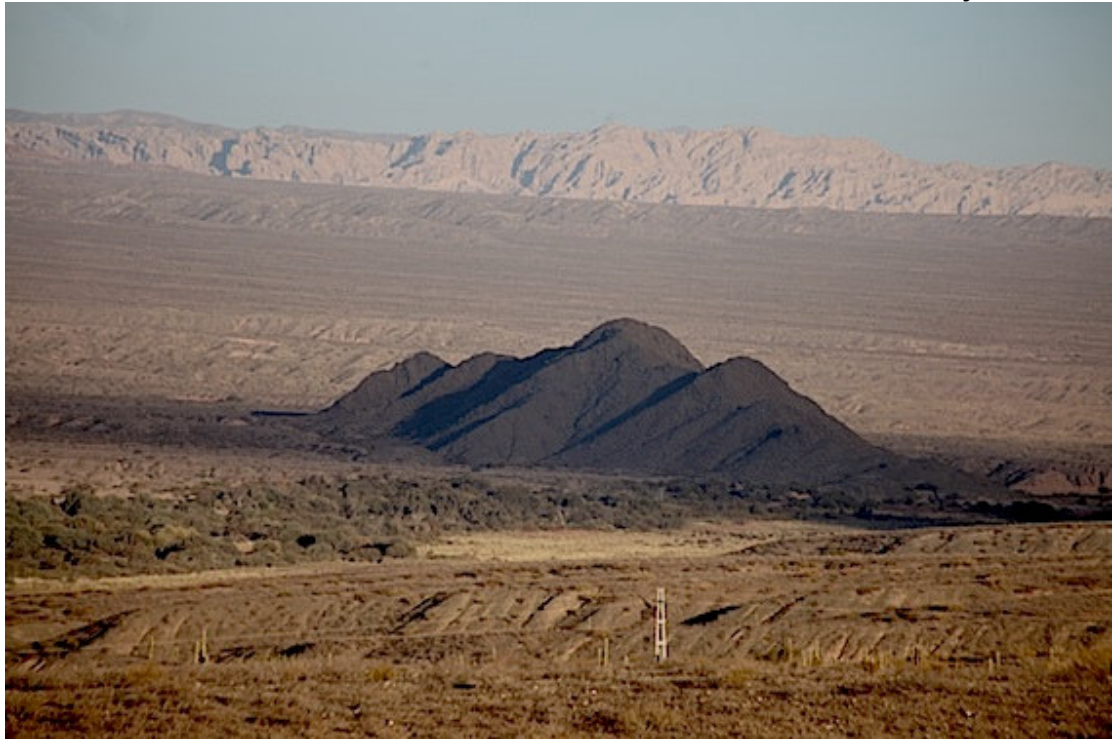
Location of Limbo