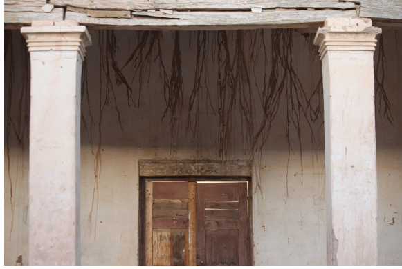
Limbo, the colony