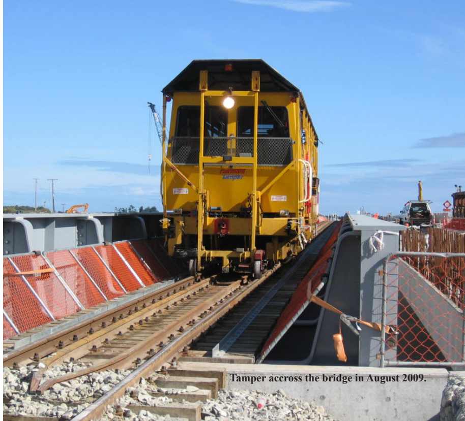
Tamper across the bridge in August 2009.

The bridge replaces the more than 120-year-old single lane bridge across the Arahura river on the West Coast. As well as separating road and rail traffic, the new structure includes a dedicated pedestrian / cycle lane which will improve safety for all bridge users.