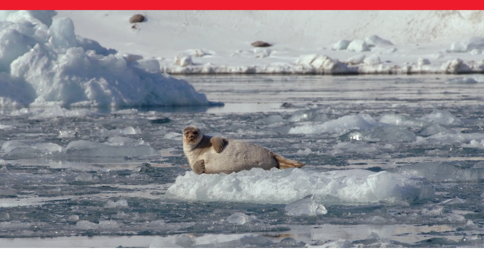
© Kit Kovacs and Christian Lydersen