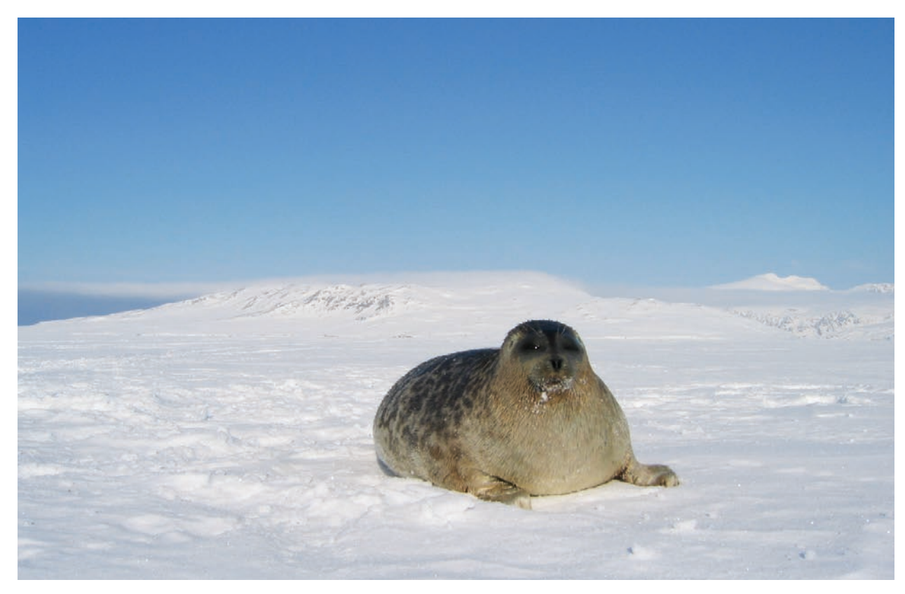
© Kit Kovacs and Christian Lydersen