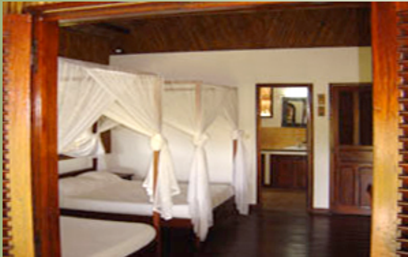
Bungalow, Relais du Masoala

Nosy Mangabe - Boat trip to the island of Mangabe (literally "big blue", center right picture on the brochure cover) for a full day excursion. Nosy Mangabe is a nature reserve set aside in the 60's as a sanctuary for what was then thought to be the rarest lemur, the aye-aye. Picnic lunch and hiking or swimming in the Indian Ocean where the forest meets the sea, before the late-afternoon 45-minute boat trip back to firm land. Overnight at the Relais du Masoala.(BLD)