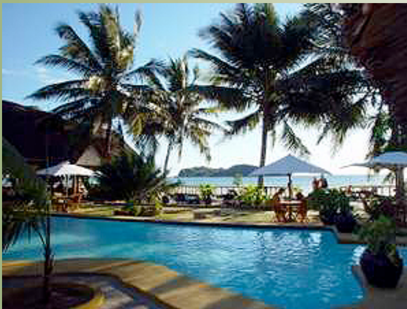
Hotel Nosy Be

Nosy Tanikely - Day trip to the neighboring island of Tanikely, a few miles southeast of Nosy Be. Nosy Tanikely is protected as a marine reserve and offers world-class snorkeling and diving. You may see turtles and a myriad of colorful fish among the coral in this shallow natural aquarium surrounding the tiny island. Overnight at Hotel Nosy Be. (BLD)