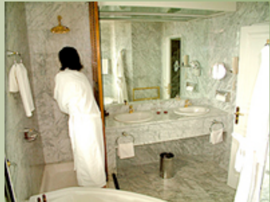
New wing of Hotel Colbert in Antananarivo