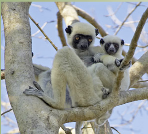
Sifaka with baby

Antananarivo - Upon arrival, clear passport control, retrieve your baggage, and meet your guide outside customs for your transfer to the venerable Hotel Colbert. In the afternoon, explore the capital, with a visit to the Tsimbazaza zoo and botanical park, including the tiny and decrepit but unique paleontology and ethnography one-room museums, for an introduction to Madagascar's culture and natural history including the unique animal and botanical wonders endemic to the island. Also visit the soon-to-be-rebuilt Queen's "rova" royal compound (including Manjakamiadana palace) towering over the capital, and affording panoramic views of the city. Meals and overnight at the Hotel Colbert. (Breakfast, Lunch, and Dinner)