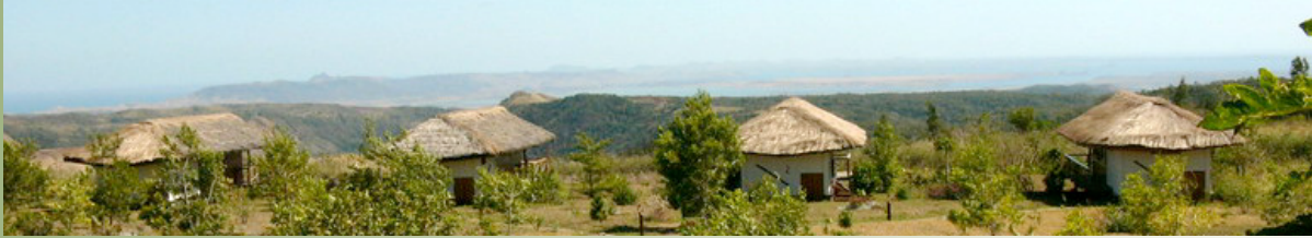
Bungalows at Nature Lodge near Joffreville