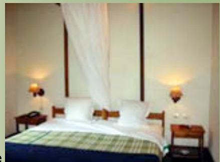
Vak na Forest Lodge