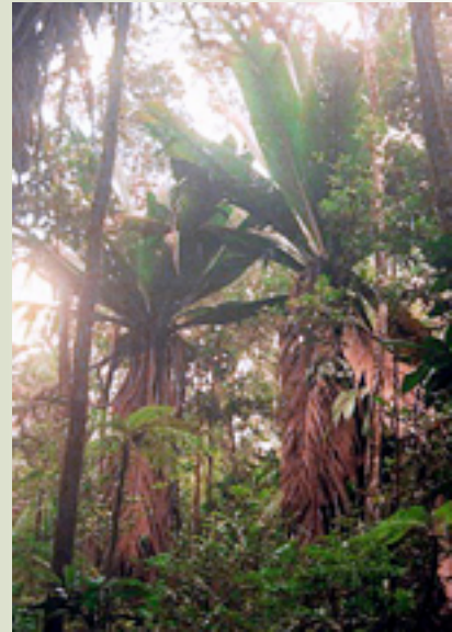
Rare ravim-be palms, Masoala

Located in Madagascar's most biodiverse region, Masoala is the largest National Park of the island. Mammal species encountered include the red-ruffed lemur, the red-fronted brown lemur, the aye-aye, the greater hedgehog tenrec, the fossa, the fanaloka, the fanalouc, and whales which visit Antongil Bay around the breeding season in the austral winter and spring. The park is also home to various species of brightly colored Mantella frogs, and all manner of extraordinary chameleons of all sizes. Masoala is also the refuge of the endangered Madagascar red owl and Madagascar serpent eagle, along with many, many endemic bird species. The flora includes the Masoala pitcher plant and the very rare ravim-be palm ( Marojejya darianii , listed by the International Union for the Conservation of Nature as one of the 12 most endangered living organisms in the world). Coral reefs teeming with life are protected in three adjacent marine parks. The peninsula also features many beautiful deserted sandy beaches. The name of the park derives from Masoala Cape at the tip of the peninsula, where navigating the treacherous straits requires good visibility ("maso" means "eye" and "oala" means haven or safe passage in the local vernacular).