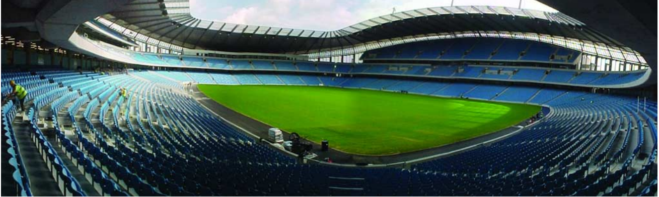
The Manchester Stadium in its final configuration as a soccer venue.

that mast. Therefore the forestay cable fans act as load-sharing devices with respect to relative displacement between rafters.