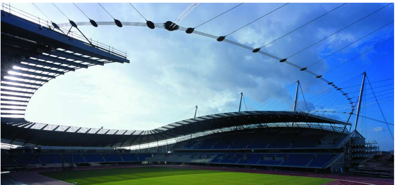
Three of the permanent stands were constructed in a horseshoe arrangement along with their associated roofs for the stadium's mid-construction role in the Commonwealth Games.

The stadium uses a method called "the grounded tension ring," an innovative adaptation of the opposing cable solution. A "catenary cable" links all the forestays together. At each corner of the stadium this catenary cable is tied back to the ground by four "corner tie cables." By pulling down at the four corners a tensile force can be induced into the entire cable net. The geometry of the cable net was defined in such a way that this pretension force was exactly equal to the force induced in the forestay cables under the worst-case wind-uplift condition. Therefore the cables do not go slack under any wind-