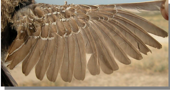
Lesser Short-toed Lark. Juvenile: pattern of wing (28-VI).