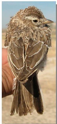
Lesser Short-toed Lark. Upperpart pattern: left adult (04-V); right juvenile (28-VI)