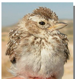
Lesser Short-toed Lark. Breast pattern: left adult (04-V); right juvenile (28-VI)