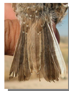
Lesser Short-toed Lark. Tail pattern: left adult (04-V); right juvenile (28-VI).