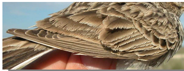
Lesser Short-toed Lark. Wing formula: tertials don't cloak primary tips: top adult (04-V); bottom juvenile (06-VII).