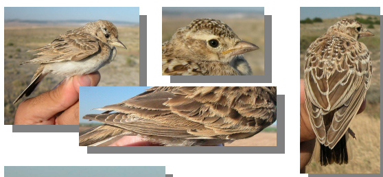
Top Short-toed Lark adult and juvenile; left Woodlark.

Among small larks, Woodlark has a marked white supercilium and black patches on primary coverts. Short-toed Lark is very similar, but lacks streaked breast and has both dark patches on upper breast; tertials cloak primary tips; breeders have black inside of upper mandible. Juveniles of both species are very difficult to determine since tertials are short in both species; usually juveniles of Short-toed Lark have longer and narrow bill and paler plumage.