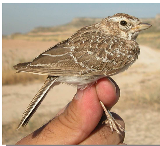
Lesser Short-toed Lark. Juvenile (28-VI)

Resident. Breeds only in steppe areas from the Ebro Basin.