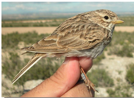
Lesser Short-toed Lark. Adult (04-V).