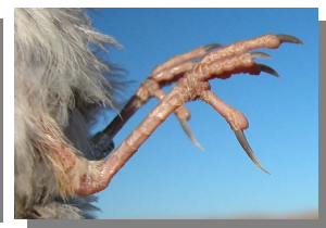
Lesser Short-toed Lark. Legs colour: left adult (04-V); right juvenile (06-VII).