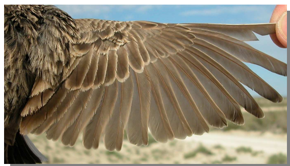
Lesser Short-toed Lark. Adult: pattern of wing (04-V).