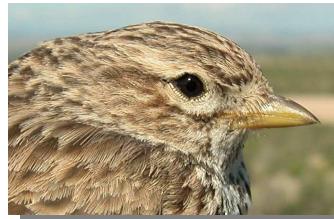
Lesser Short-toed Lark. Pattern of head and bill: top adult (04-V); bottom juvenile (28-VI)