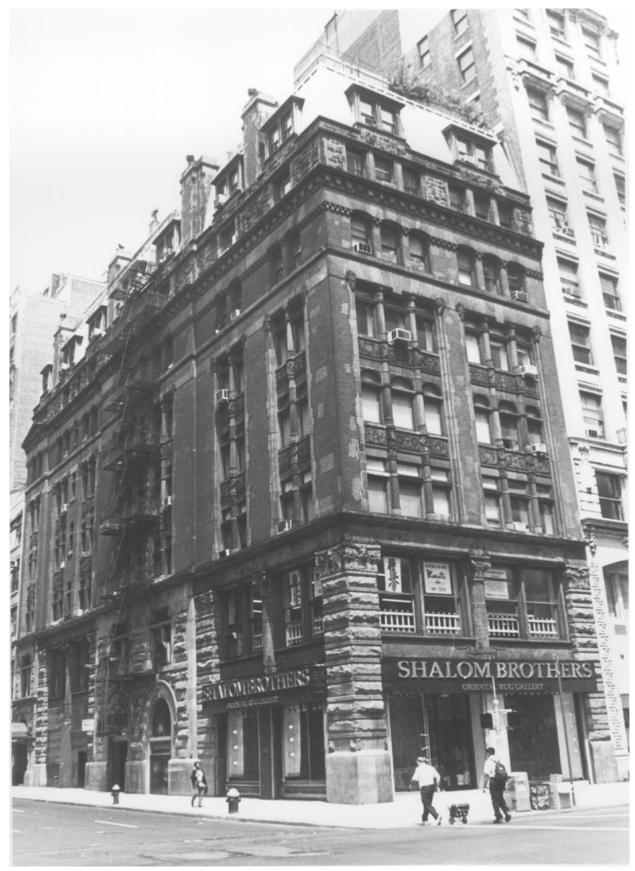
The Wilbraham, 1 West 30<sup>th</sup> Street (aka 282-284 Fifth Avenue)