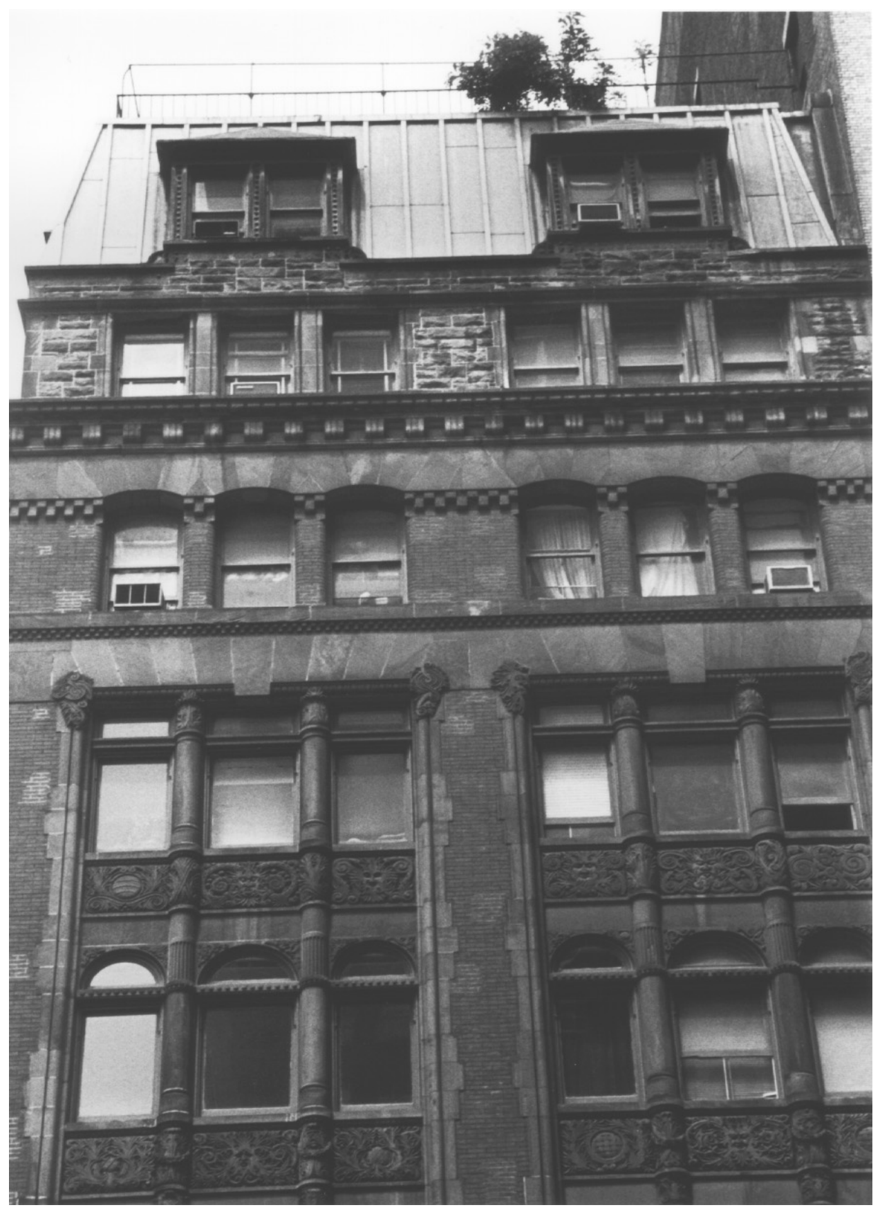
The Wilbraham, Fifth Avenue façade upper section