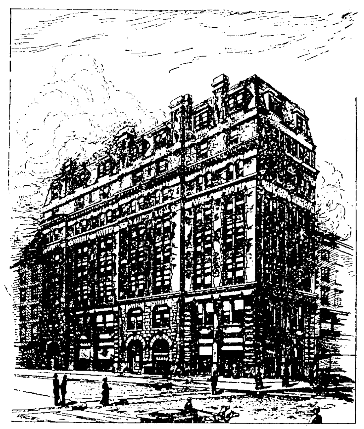
The Wilbraham, rendering