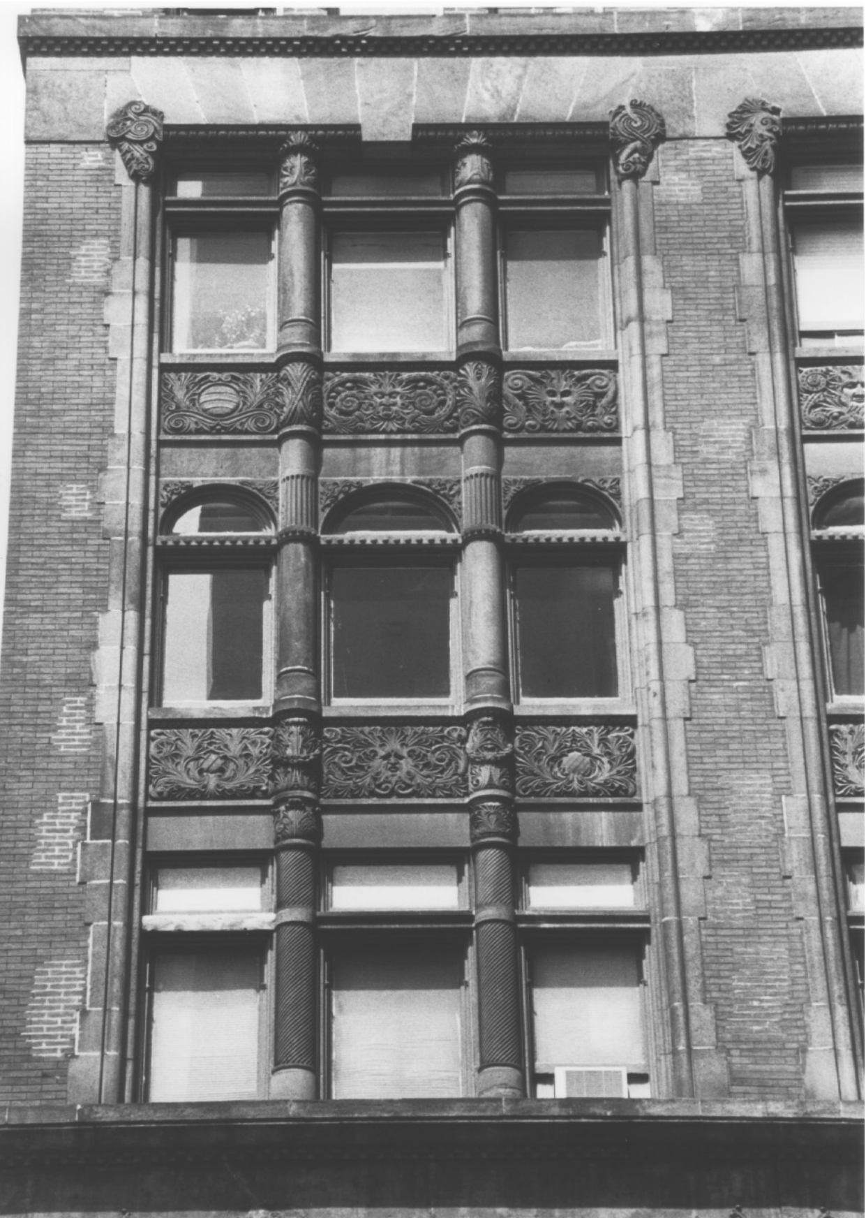
The Wilbraham, Fifth Avenue façade, detail of third through fifth stories