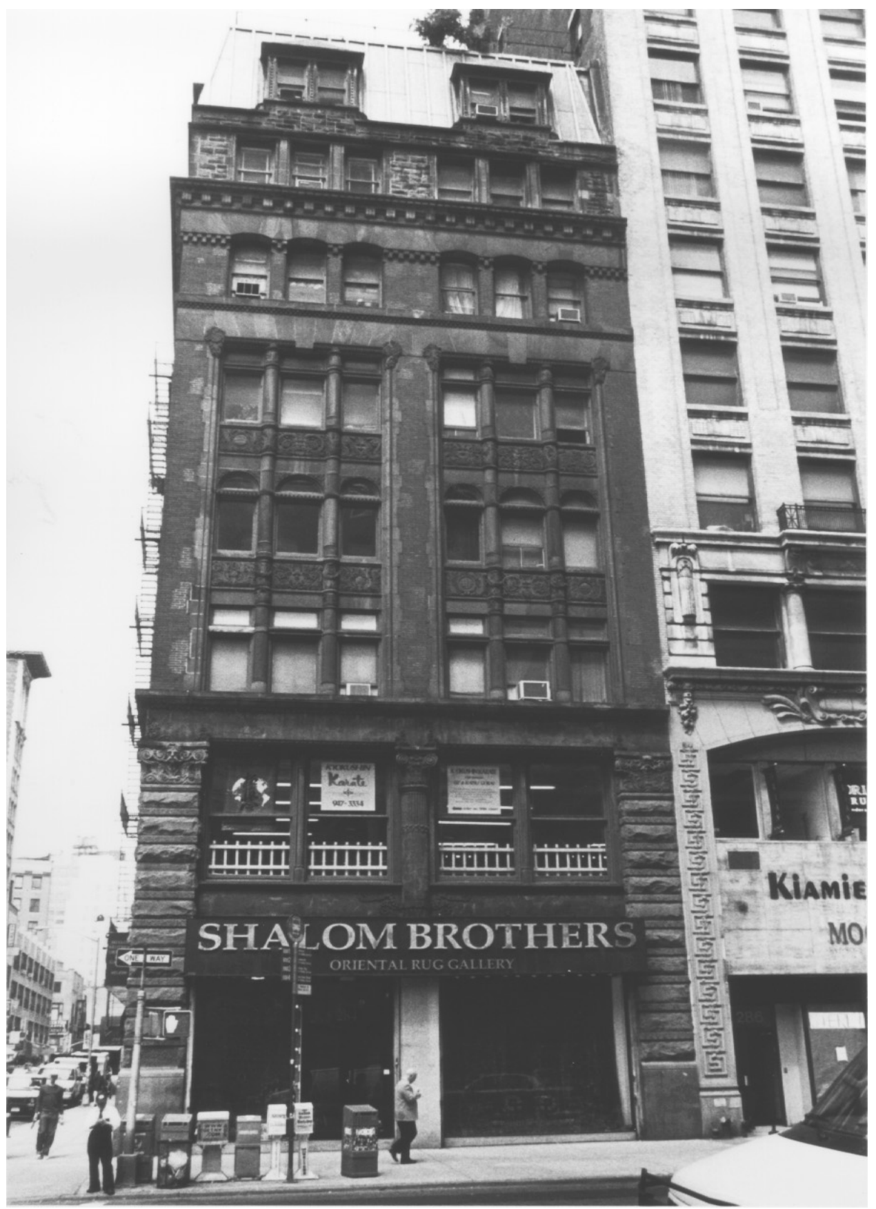
The Wilbraham, Fifth Avenue facade