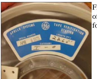
Fig. 2 A photo of one of the ARCSAV tapes found at WNRC.