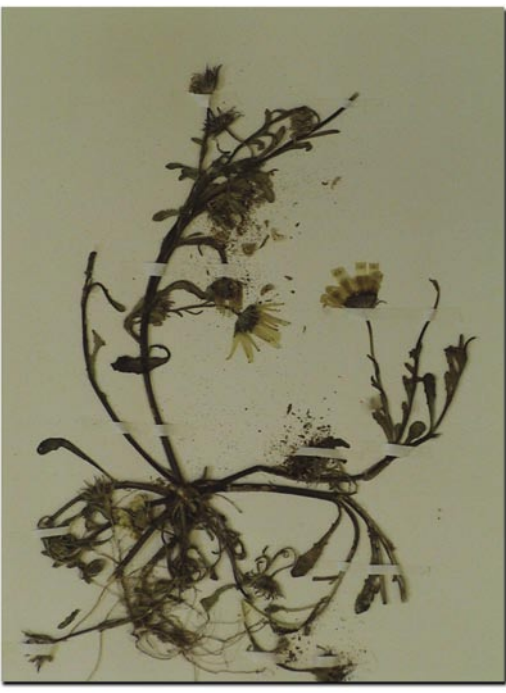
A specimen damaged by the cigarette beetle.

The simplest method of ensuring that no contaminated material is brought into the herbarium is to freeze all new accessions after drying . Some insects can survive short periods of freezing, so the specimens should be frozen at -18°C for at least 48 hours. Microwaving