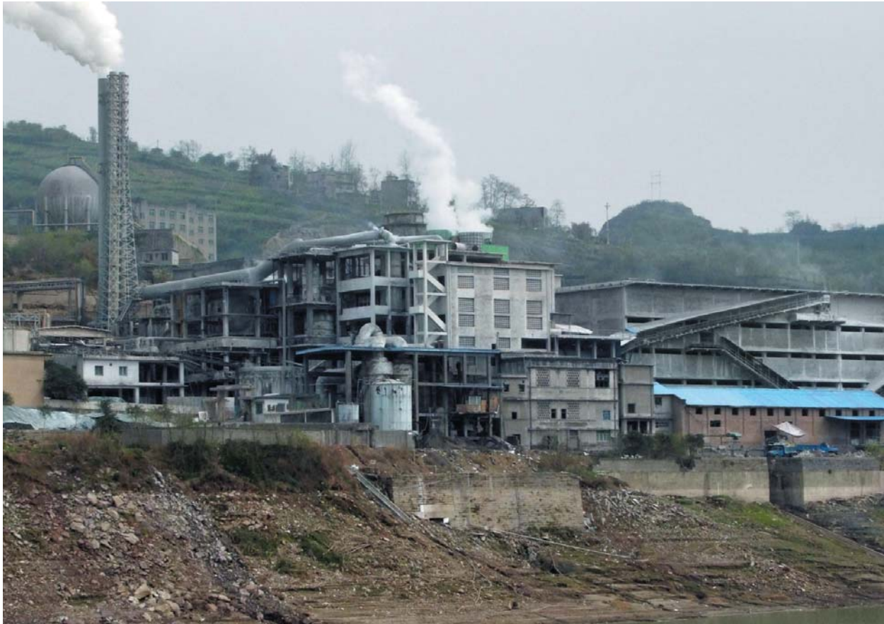
Industrialization in China

climate change, and they also boost the GHG intensity of whatever growth does occur. Section 2.2 offers examples of both effects.