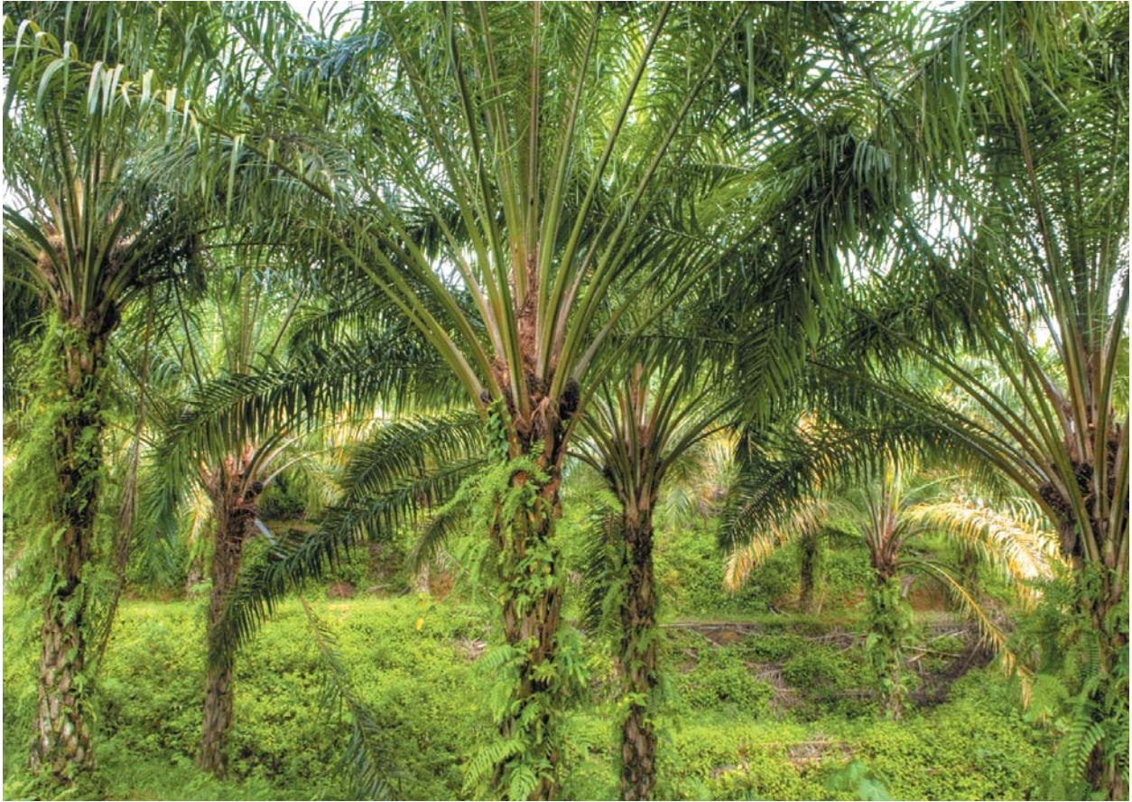
Malaysian palm oil plantation

Harm from climate change follows this logic. GHG emissions can alter the climate. Some of the changes may impose costs on some activities and some countries. Yet proposed solutions, like rationing the use of fossil fuels, halting the felling of tropical forests, or shrinking livestock herds, are themselves costly. Hardening the activities affected by climate change against harm might offer lower-cost means to reducing harm from climate change.