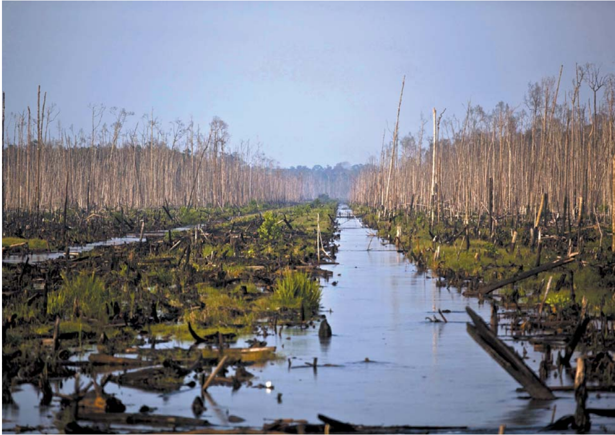
Peat swamp in Riau Province, Sumatra, Indonesia

to fill this vacuum. That effort has failed. Absent a state willing and able to act as an effective leader, the transaction costs of regime building rise.