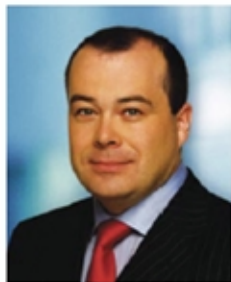
Denis Naughten (FG)