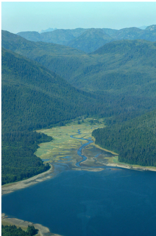
Fig 2. Crab Bay, Tenakee Inlet, East Chichagof Province.

This conservation assessment, resource synthesis, conservation strategy, and GIS tools are provided to enhance the conservation efforts of resource managers, scientists, and conservationists in Southeast and the Tongass. Application of the most recent principles of conservation biology, supported by new GIS technology, should assist forest and wildlife managers in refining conservation strategies to safeguard the biological diversity and ecological integrity of Southeast in balance with sustaining local economies and the unique quality of life enjoyed by the people of the region.