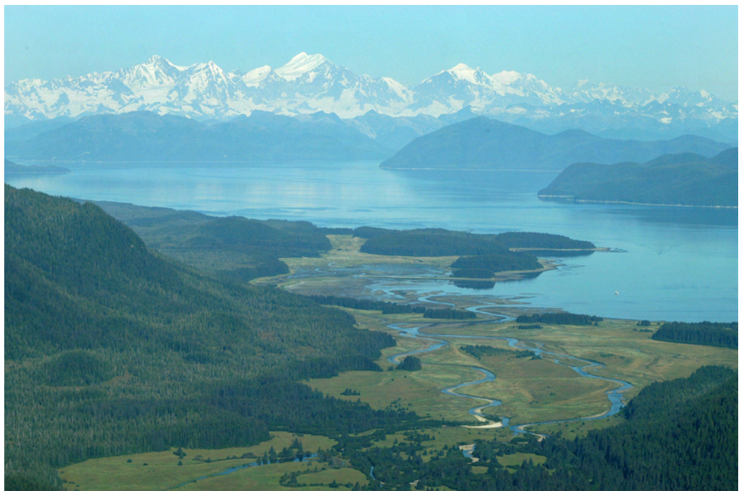
FIG 1. Mud Bay on North Chichagof Island, looking north to Glacier Bay and Mt. Fairweather.

Encompassing over 5,000 islands within the Alexander Archipelago and more than 18,000 mi (30,000 km) of marine shoreline, Southeast supports abundant populations of wildlife and fish species, many of which are rare or threatened in the lower 48 states. Approximately 80% of Southeast is contained within the 16.8 million acre (6.8 million ha) Tongass National Forest. Established as a reserve by presidential proclamation in 1902, President Theodore Roosevelt expanded the reserve and named it the Tongass National Forest—the nation's largest—in 1907. Roughly the size of West Virginia, the Tongass contains nearly a third of the rare old-growth, temperate rainforest on earth and retains the greatest