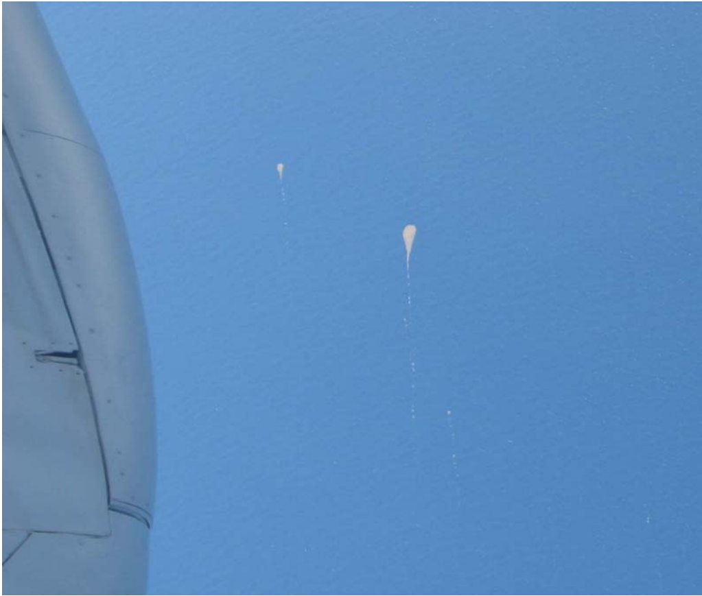
Figure 2. Oil globs on the surface of the ocean at 86^{\circ} 30''\text{W} , 28^{\circ} 20''\text{N} from the NOAA WP-3D downward-looking camera.

In addition, the NOAA WP-3D research aircraft was also outfitted with the Stepped Frequency Microwave Radiometer (SMFR) and the downward looking Infrared Radiometer Thermometer (IRT) acquired data on sea surface properties such as Sea Surface Temperatures (SST) and Brightness Temperatures from the multiple channels from the SFMR. These measurements allow us to distinguish between the oil slick mass and the surrounding sea water. These data have not been processed.