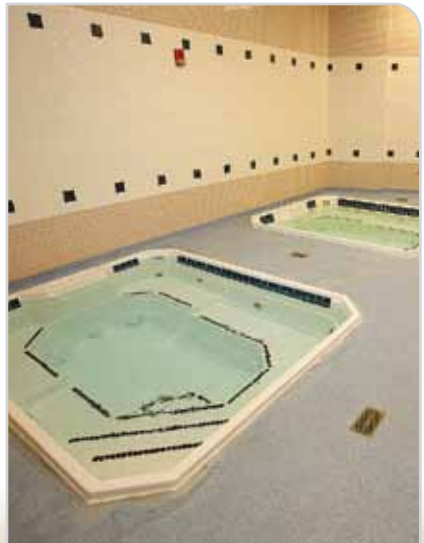
Hot and Cold Tubs