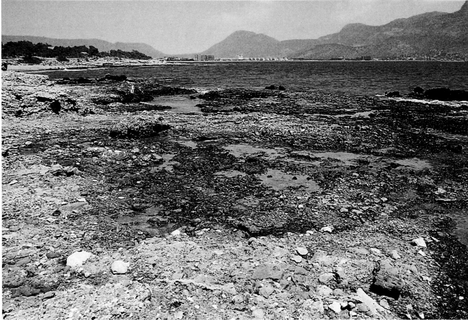
Fig. 2. Habitat of Lophyridia aphrodisia cypricola west of Yeşilovacık, Içel province.

coast, with a presumed northwestern distribution limit south of the Büyük Menderes delta. The more northerly İzmir region is a well known northern distribution limit for various Mediterranean faunal elements (tiger beetles: Megacephala euphratica [FRANZEN 2001] and Lophyridia concolor [FRANZEN 1999]). Since rocky seashore habitats predominate along the western and central Mediterranean coastal stretch, the distribution may be more or less continuous there. However, most of these areas are almost inaccessible to man and this may be the reason for the species' apparently fragmented distribution.