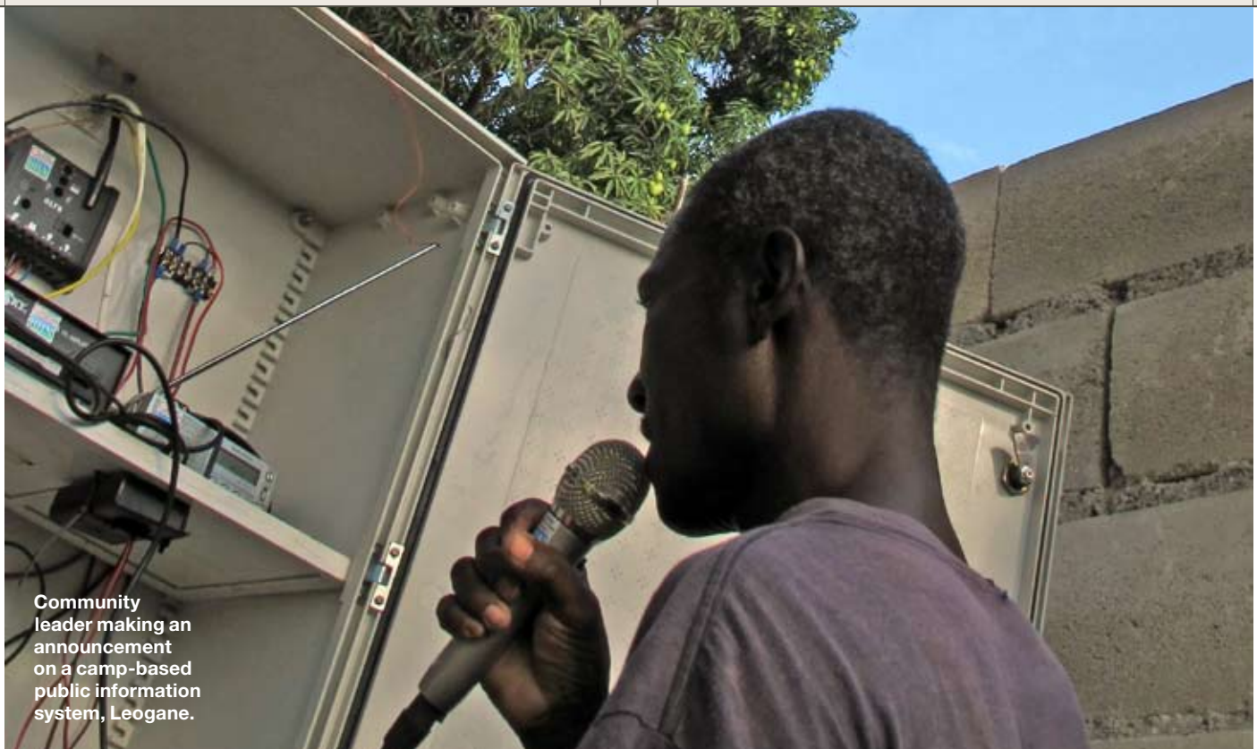
Community leader making an announcement on a camp-based public information system, Leogane.