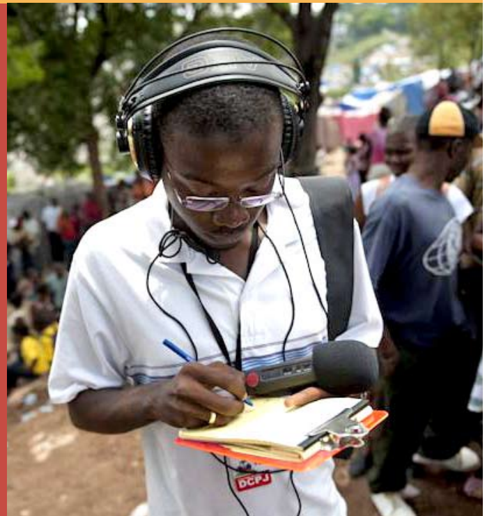
ENDK reporter working in a settlement of displaced earthquake survivors.

ENDK today is produced by a team of 19 journalists,