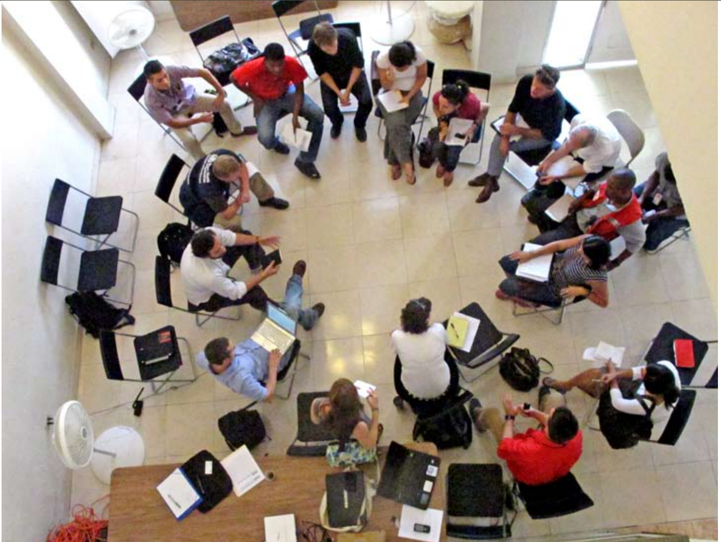
CDAC Haiti meeting, November 2011.

mobilisation team, for example, frequently went to camps to facilitate discussion and explain upcoming initiatives before they were launched as a way of keeping situations calm and community relationships smooth.