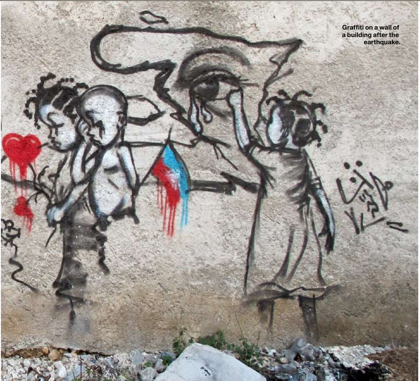
Graffiti on a wall of a building after the earthquake.

“I would say that registration [of those in camps] would have been almost impossible without the support of the communications teams.”