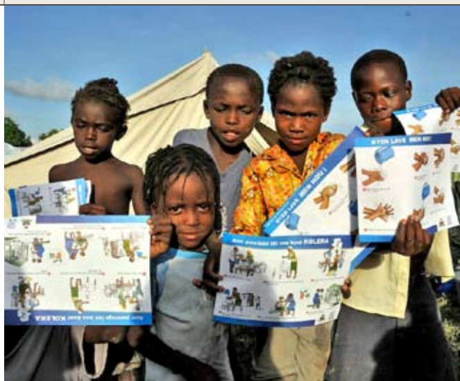
Cholera campaign and kids.

The strength and commitment of the Ministry of Public Health was also a factor, particularly in ensuring