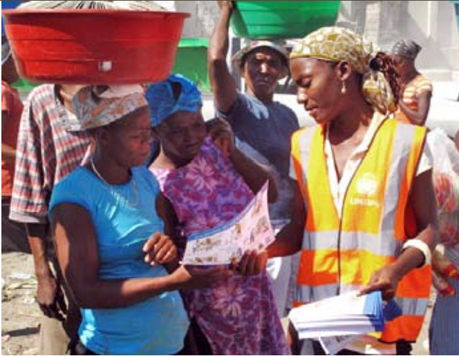
UNOPS community mobilisers hand out government fliers and explain cholera.

communication staff able to reach out to survivors, not simply meetings with project staff. In Haiti, this was most obviously implemented through the work of community mobilisers (also called 'liaison' or 'animation teams' by some organisations). This kind of work was key for three main reasons. Firstly it was often the best way to share information, especially on complex issues, as it allowed for dialogue and for recipients to ask questions. Secondly, person-to-person communication was by far the best means of sharing practical information that required demonstrations such as securing tents. Thirdly, the feedback from Haitians strongly suggests that they liked face-to-face communication because of its psychosocial value: the feeling that someone cared and was willing to talk to them.