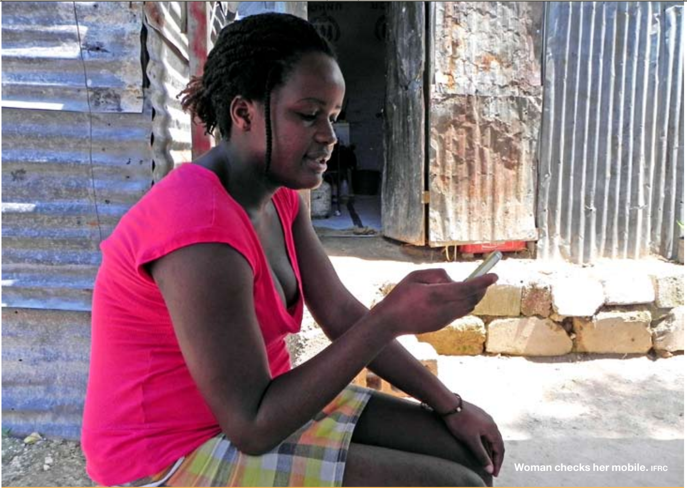
Woman checks her mobile.