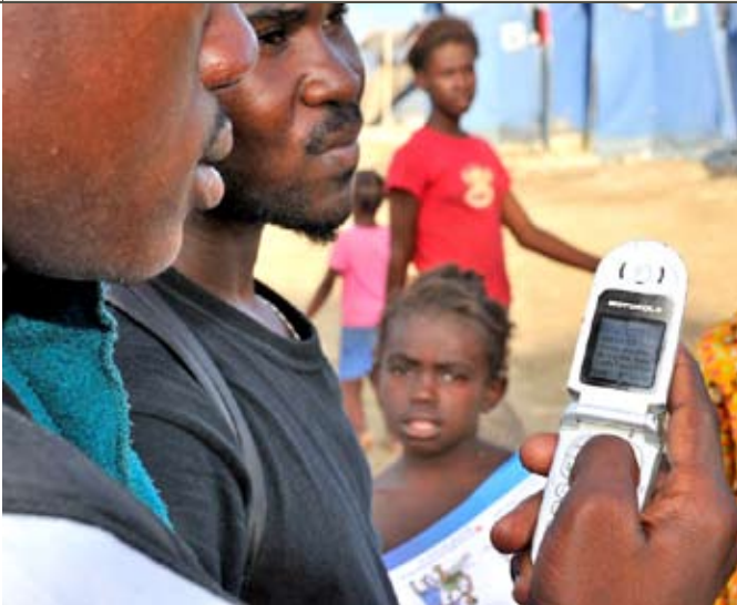
Man receiving a text about cholera on mobile phone.