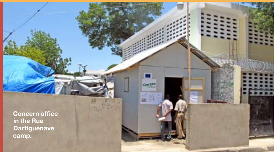
Concern office in the Rue Dartiguenave camp.

Concern was careful to put all distributed documents on public display and provided an ongoing source of information and discussion at the camp office, where local staff could meet with