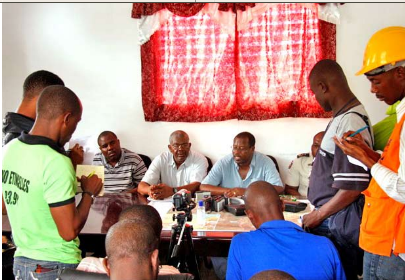
A local press conference at the Gonaives City Council, November 6 th 2010. GUILLAUME MICHEL