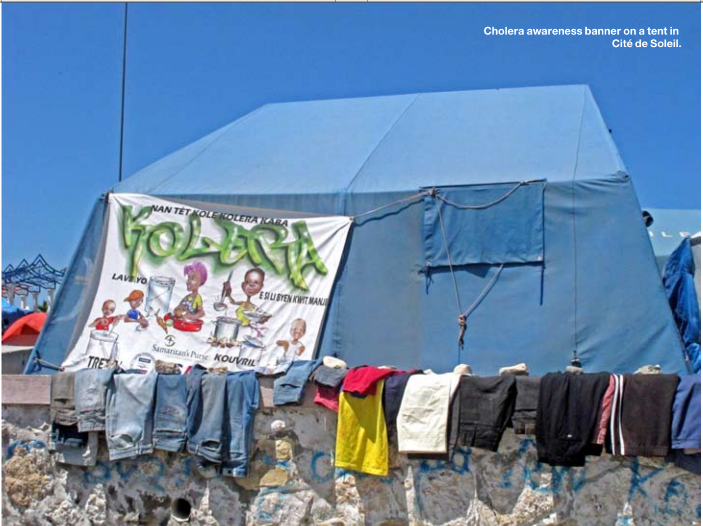
Cholera awareness banner on a tent in Cité de Soleil.