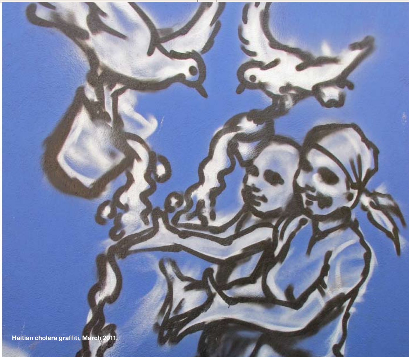
Haitian cholera graffiti, March 2011.

Almost uniformly, the approach taken to determining impact was a classic baseline/endline methodology, which looked for retention and action on the key messages promoted by the cholera information campaign. The evidence provided by the HRC paper and discussions with medical staff and community mobilisers suggest that this was not adequate as an approach, with little scope for identifying key barriers to behaviour change from the Haitian perspective.