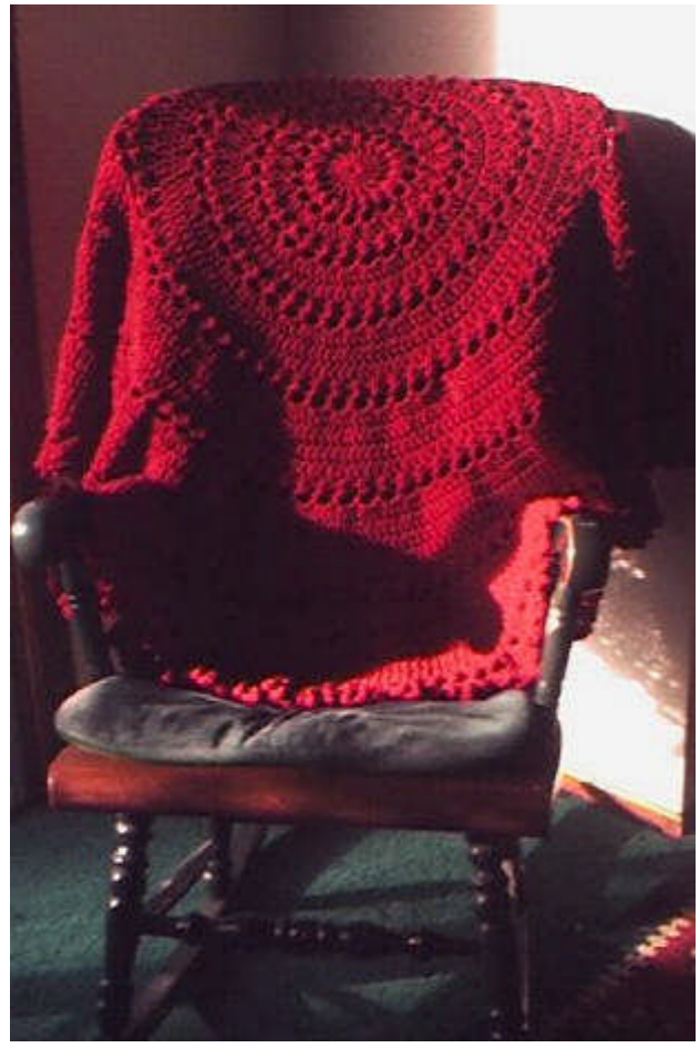
Skipping Stones Circular Afghan by Priscilla Hewitt ©2000